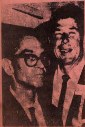
RAPSCALLION "RAT MAN"