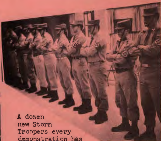
A dozen new Storm Troopers every demonstration has the enemies of the White Race shaking.