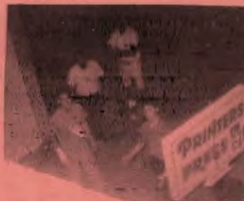
Camera captures "white niggers" during Watts Riots

We will not back down from what we know is right. These are never before published pictures taken at the siege of our Headquarters during the Watts rioting of August, 1965. There is nothing legally or morally wrong in anything we've done, but it does not take a "Perry Mason" or a Dr Goebbels to see how an unscrupulous persecutor could use them to enflame a mob or a jury.