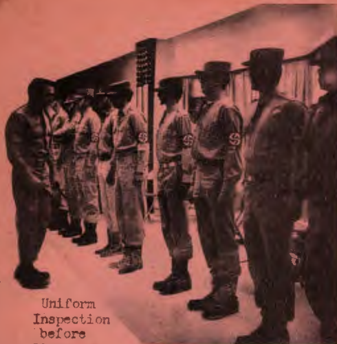
Uniform Inspection before Picket