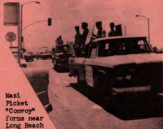
Nazi Picket "Convoy" forms near Long Beach Marina