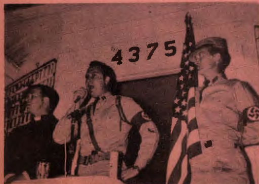
ANGRY WORDS AFTER PATLER IS FELLED!

CONSERVATIVE - A word derived from the prefix "to con" meaning in this case "easy to fool", "a push-over for the most illogical jew big lies;" and the root "servi" meaning "one who slavishly worships and serves the jews, eg. Wm. F. Buckley, Jr." (Buck up old man, we're only teasing you again.)