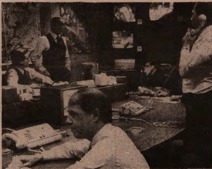
Photo of FBI "secret" Emergency Operation Center on 6th floor of FBI building in Washington. This world-wide operation has yet to free any of the U.S. hostages still held in Lebanon!