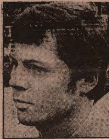
Bob Mathews gave his life in launching the Second American Revolution.

One reason Bob Mathews went underground is that he was tired of FBI and Jew ADL harassment and was no longer willing to take it. Likewise, David Lane was arrested in Aurora, Colorado for distributing White Supremacy literature. He fought the case, won, and his literature was returned. Lane later left Denver and joined the Aryan Nations Church in Hayden