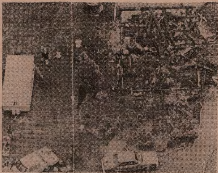
The remains of Bob Mathews headquarters after the FBI firebombing. Even as the house exploded in a fireball he continued to blast away with his machinegun after a day and a half one man battle against 100 agents!

Still, one man remained inside. He refused to surrender. He shouted that he would fight to the death - THIS WAS BOB MATHEWS! The FBI fired volley after volley of gunfire and tear gas into the house. Twice they tried to sneak up on the house and each time were driven back by Mathew's machine gun fire. All bridges to the island were cut off and armed motor boats lay below the cliff upon which the house set. Twice helicopters swept in trying to drop firebombs into the home to burn Bob Mathews alive but bursts of machine-gun fire drove them off. This massive seige by over 100 FBI and SWAT team agents went on for an amazing period of 40 hours - A DAY AND A HALF!