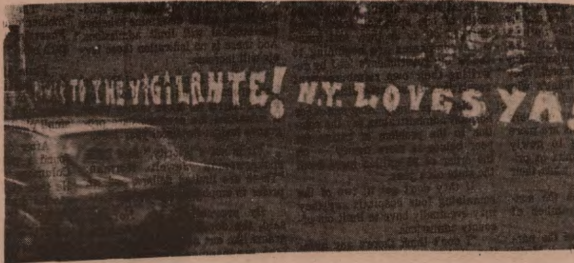
Signs greet Bernard Goetz, "The Subway Vigilante," as police escort him into the city reading: "Power To The Vigilante!"