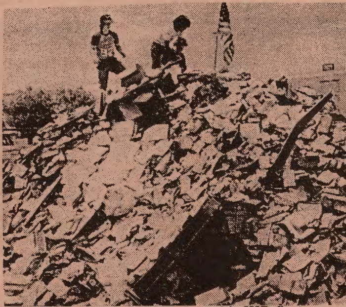
Thousands of Patriotic books burned in IHR fire cheered by JDL.

Senn Fein (meaning "Our-selves Alone") certainly applies to such cases. Only WE can protect our own kind from alien attack. Let the JDL and their fellow-travelers be on notice that a new day has arrived. No longer will White Patriots be pushed around, persecuted, tormented, harassed, and attacked. From now on it shall be an all new game - if we are attacked - WE WILL FIGHT AND NO QUARTER WILL BE GIVEN!