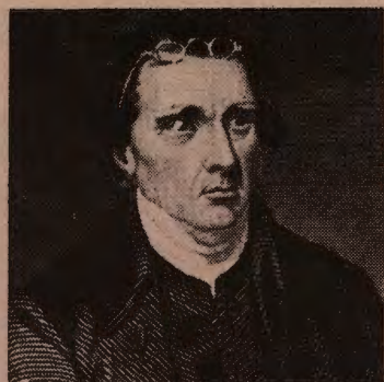
Patrick Henry, was the most eloquent and powerful orator in the cause of the First American Revolution!

Sir, we are not weak if we make a proper use of those means which God has placed in our power. The battle Sir is not for the strong alone, it is to the vigilant, the active and the brave. Besides, Sir, we have election if we were base enough