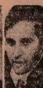
Schmitt Victory in N.M.