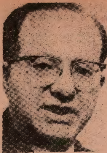
ELI M. BLACK

Eli Black had just been exposed for giving a $1.25 million bribe to a Honduran politician to lower the tax from 50 cents to 25 cents on each box of bananas shipped from United Brands 27,000 acre farm in that banana republic. This revelation brought about the overthrow of the Honduran government by