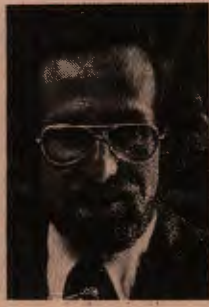
Dershowitz: Goes in Justice Dept.