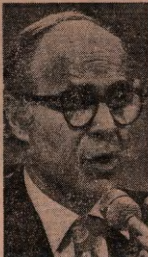
Prof. Lawrence R. Klein of the University of Penn- sylvania, RECENTLY left the U.S. Communist Party

It was too bad the millionaire Jew Howard Metzenbaum was able to buy Sen. Taft's Senate seat. But we can't win them all, and he probably will be a one term Senator.