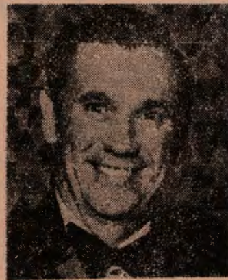
Gov. Reubin Askew