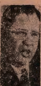
Hartke Radical Out