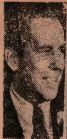
Luger Wins Ind.