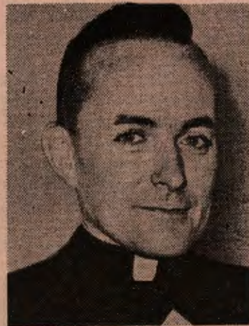
The Rev. Andrew Greeley

Aaron, Abraham, Alan, Albert, Anna, Arnold, Barnett (Barney), Bella, Benjamin, Bernard, Chaim, Daniel, David, Dora, Dorothy, Eli, Emma, Esther, Ethel, Eva, Fannie, Felix, Goldie, Han-ya, Harold (Harry), Howard, Hyman, Ida, Ira, Irving, Isaac, Isidore (Izzy), Jerome (Jerry), Joel, Jonathan, Joseph, Julian, Julius, Leah, Leon, Leonard, Lillian, Louis, Manfred (Manny), Many, Marcus, Marvin, Maurice, Max, Melvin, Meyer, Milton, Minnie, Moses (Moe), Morris, Murray, Myron, Nathan, Norman, Paula, Pauline, Pearl, Rebecca, Rhoda, Rosa, Rose, Ruth, Samuel, Sanford (Sandy), Sarah, Saul, Seymour, Sheldon (Shelly), Sherman, Sherwood, Sidney, Solomon (Sol), Stanley, Tanya, Vera.