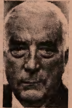
SIR ROBERT MENZIES . . . racist group patron.

Prominent Patriot rallies to cause of White Race Survival in Australia. (Below reprinted from "New Zealand Herald.")