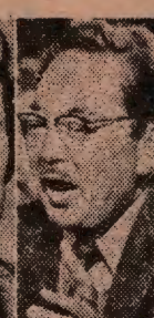
Hayakawa Upset Victor