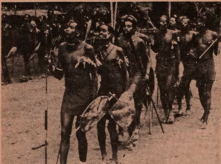
THIS IS a recent photo of the Masai tribe as described by Pres. Teddy Roosevelt. They still have made no progress toward civilization.

It must be noted that the White race, even in prehistoric days, knew to bury its dead, never were cannibals, and honored and respected the family. Today, over 50% of all negro households in America are headed by the female. The father has deserted his family leaving them to subsist on the welfare rolls. The jungle terror that permits every negro ghetto community in America is not much different than the tribal life as it exists in Africa today, in 1910, or back to the year 2,000 B.C.