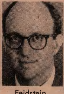
Feldstein New Labor Secy.