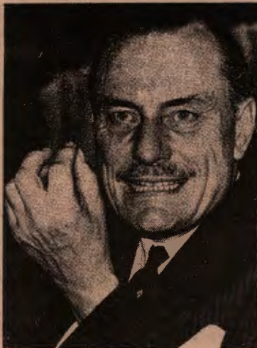
ENOCH POWELL, M. P. issues plan to pay coloreds to leave England.

4) Asians in England pay almost no income tax because