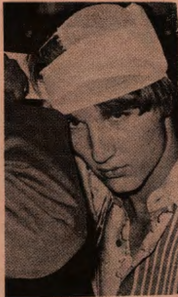
YOUNG victim at Cobo Hall concert after senseless beating.

Brutal negro gangs now rule our major cities and the police are simply too afraid to move in and arrest them! At the same time the anti-gun crowd wants to pass more laws restricting the right of the law abiding to "keep and bear arms."