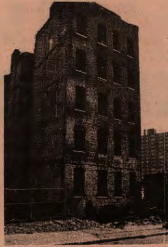
BURNED OUT building in Newark, N.J. Looks like bombed out Berlin after W.W. II.

Newark, New Jersey has been completely taken over by blacks. Its downtown business district is deserted after 5 o'clock. It has the highest crime rate in the state and one of the highest in America. Some 400,000 negroes, 33 percent of Newark's population, receive some form of welfare. Of those under age 25, the unemployment rate is 40% and 25% for those over 25. Many of the beautiful White neighborhoods taken over