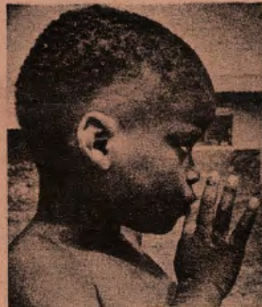
NEGRO CHILD found living with apes in Africa. Note calluses on hands caused from walking on all fours with the apes.