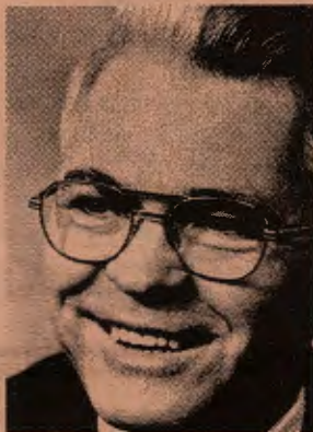
JOHN R. RARICK

The largest single Eximbank loan to Russia $153,950,000 went to finance their tremendously large new multibillion dollar Kama River truck project, the largest truck and engine factory in the world, which at full capacity, would turn out 150,000 trucks and 250,000 diesel engines