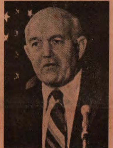
PROF. JAMES S. COLEMAN, engineer of busing, admits that interracial marriage is the "desired" end product.

The man who first came up with the idea of forced busing to mix the races is Prof. James S. Coleman. While a sociologist at the University of Chicago 10 years ago, he dreamed up the idea of busing children and it was called "The Coleman Report." Now today he admits that his plan was actually to br-