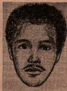
SKETCH of killer of elderly Catholic Priest.