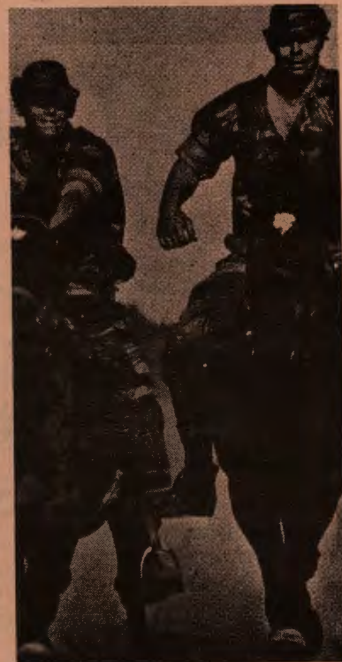
THE RHODESIAN calvary scatters negro guemillas easily.

LET ONE AND ALL KNOW THAT WE STAND BEHIND THE STRUGGLE OF OUR RACIAL BROTHERS IN SOUTH AFRICA AGAINST COMMUNISM AND FOR FREEDOM!