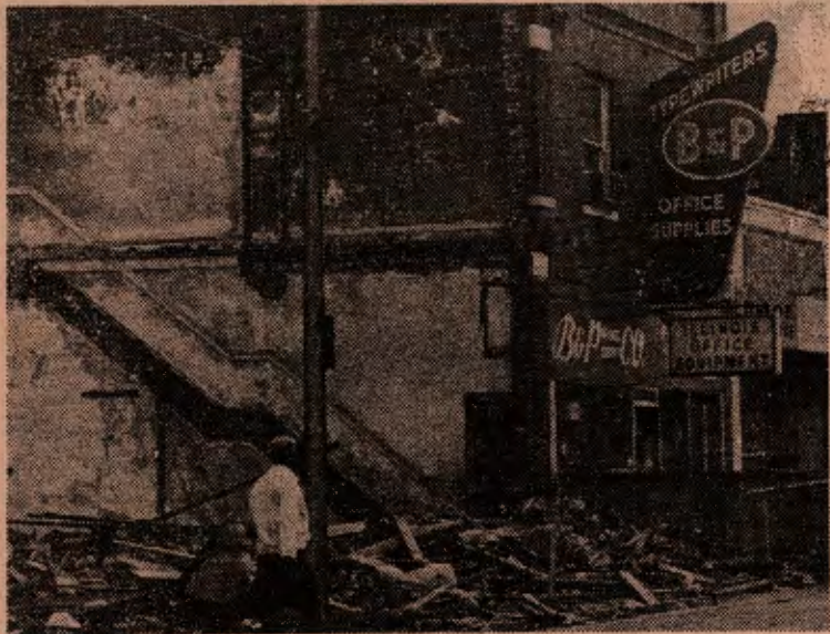
DOWNTOWN EAST ST. LOUIS, Ill., looks like bombed out Berlin at the end of WWII. This is Broadway in the heart of what is left of the business district.