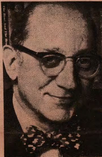
EDWARD LEVY, first Jewish Attorney General in history, demands private Christian schools accept negroes.

Kissinger was initially chosen for his post in the Nixon Administration by Nelson Rockefeller. He had been a key Rockefeller aide and his support of Nixon at that time was dependent upon the Kissinger appointment.