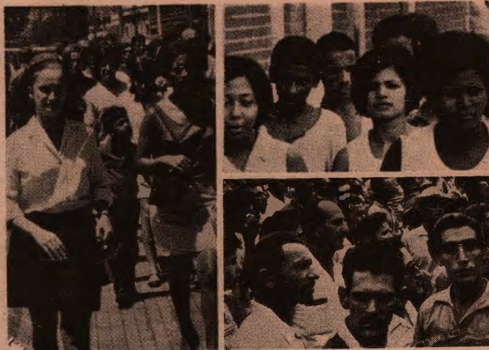
The rapidly changing face of America's largest cities. Already the Whites are in the minority!

All rents in the four states have been driven up to ridiculous heights by the Mexican absorption of all poor peoples' housing. The Mexican ghettos flourish through illegal commerce, drug trafficking, welfare, Federal aid, and the organized pressure of a whole new system of rotten boroughs based on alien bloc voting. The victims of this invading horde are not the Beverly Hills liberals who whine for "unconditional total amnesty for all undocumented people in the United States,"