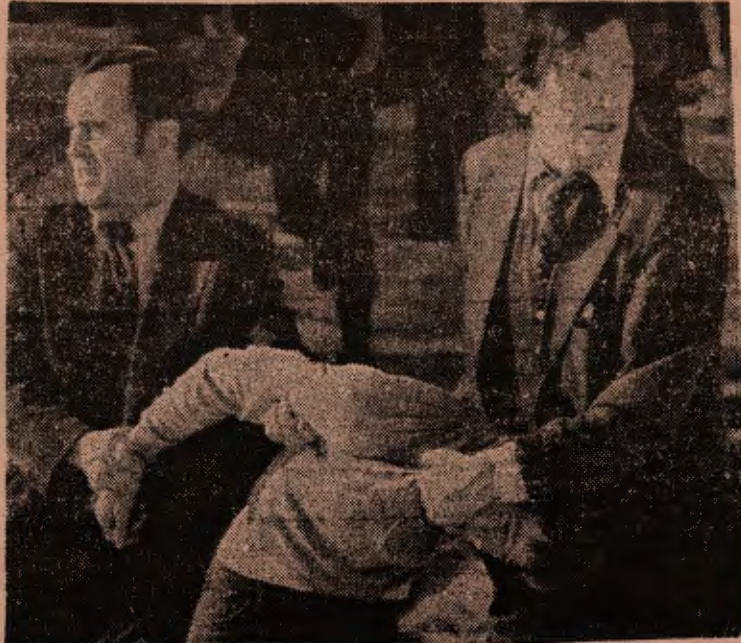
POLICE AT BOSTON'S Hyde Park School use unnecessary force on young anti-busing demonstrator.

This problem extends right into the police departments. White officers are more harsh on White students and especially anti-busing demonstrators. The Thunderbolt has reported numerous accounts of unprovoked attacks on peaceful White demonstrators in Louisville and Boston. Outright beatings of detained and even handcuffed Whites have taken place. Nothing like this ever happens to negro students. If such did Atty. Gen. Levi would rush in the FBI to see if the non-