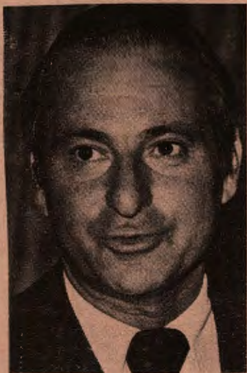
Helmut Sonnenfeldt, top Jewish aid to Kissinger, says Soviets should keep all of Eastern Europe.

Kissinger was initially chosen for his post in the Nixon Administration by Nelson Rockefeller. He had been a key Rockefeller aide and his support of Nixon at that time was dependent upon the Kissinger appointment.