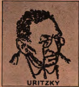
The First head of the Communist Secret Police under Lenin was the Jew Uritzky.

"...The Polish masses... gave vent to the (anti-Semitic) feelings which had been pent-up during the Stalinist dictatorship, and openly started assaulting Jews."--The Gates of Zion* (London: Central Synagogue Council of the Zionist Federation of Great Britain and Ireland*), October 1957, p. 8.