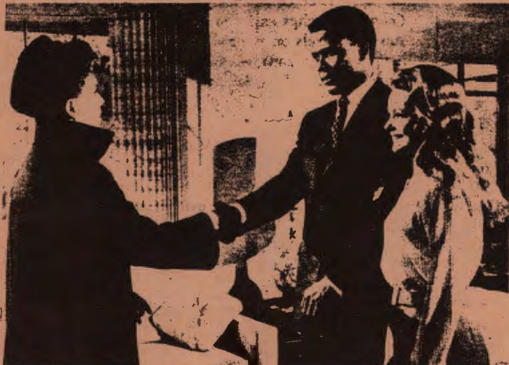
KATHERINE HOUGHTON (right) brings her fiance, a doctor (Sidney Poitier) home for dinner. Katharine Hepburn (left) thinks they make a charming couple.