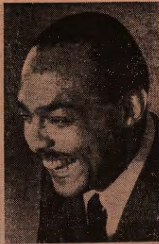
Richard G. Hatcher Carl Bolden Stokes