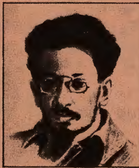
Was the first Jewish President of Russia after the revolution. Lenin was Chairman.