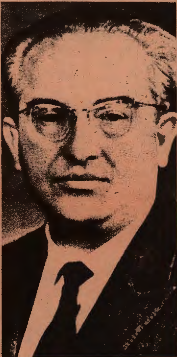
Yori V. Andropov, the evil-eyed Jew Kosygin admits is now head of the dreaded Soviet Secret Police (The K.G.B.).

The greatest murder and terror machine the world has ever seen has been the secret police system of Russia. Since 1918, millions of people have lived in fear of being taken away in the middle of the night, never to be heard of again by friends or family.