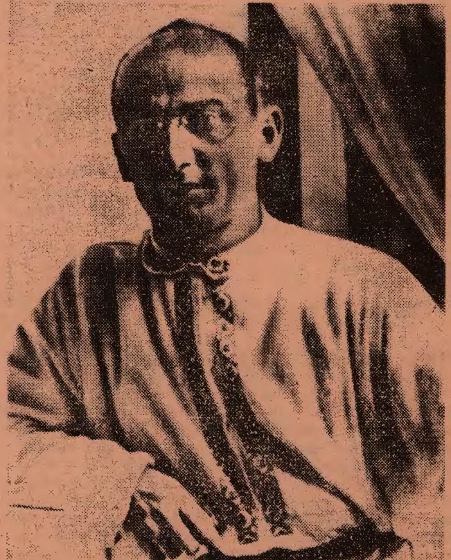
Beria Is Shown Wearing Ukrainian Blouse

Greatest mass murderer of all time. The Jew Beria headed the Secret Police under Stalin longer than any other person.