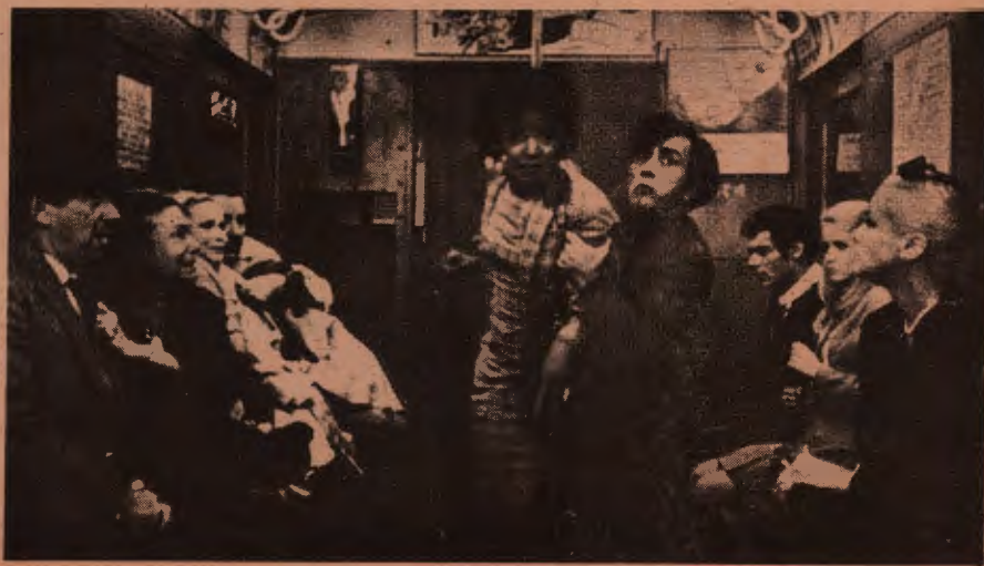
FILM SHOWS BRUTAL WHITE YOUTHS TORMENTING POOR PERSECUTED NEGROES

is a code which says that the negro may never be shown in a bad light. They must be made into heroes (note roles given Sidney Poitier). Only White Christians may ever be the 'bad guys.' Thus the crimes of the negro is laid upon the Whiteman. When the daily press censor the racial identity of such criminals, those who recently visited their neighborhood theatre are led to believe that most criminals are Whites. The time has come for us to remove the Jews from control over our TV and movie media if we want truth to reach the people.