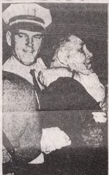
CLAMPED IN STRANGLEHOLD by policeman, a participant in near-riot is led to police wagon. Man was released after Nazis were hauled off to police station.