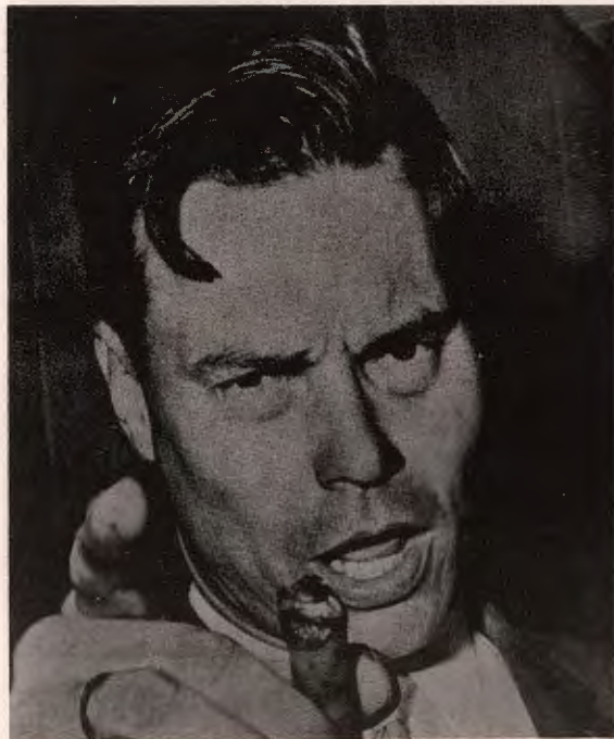
George Lincoln Rockwell . . . .