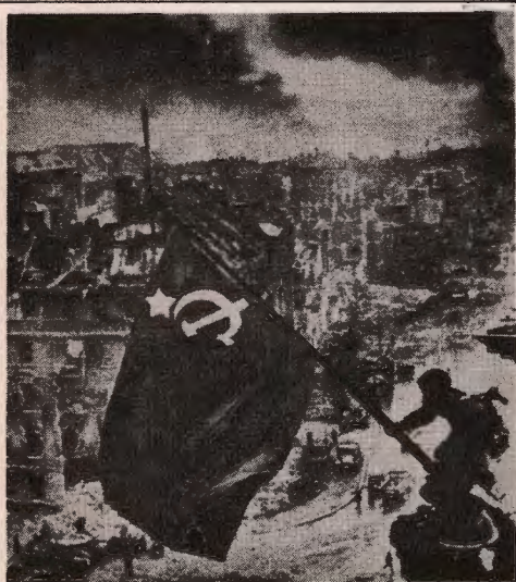
Red flag atop the Reichstag ruins, May 5, 1945

leaning in some cases ("National Socialism" in Germany), were extremely anti-communist, primarily because they could not pledge allegiance to Moscow, a foreign power. Some of them, in fact, were first-rate military threats to the fledgling Soviet Union. They had to be removed before Russian communism could dominate Europe. They were removed — at the expense of the lives of almost 300,000 American men. And in every instance in which our Office of Strategic Services encouraged resistance groups in the "conquered nations," THEY CHOSE THE MOST BLATANTLY COMMUNIST GROUP (including Ho Chi Minh's group in Indo-China). At the end of this conflict the United States had gained nothing. Britain, France, the Netherlands, Belgium, while on the "winning team," lost their empires. The Soviet Union was the only real "winner." Its influence was extended to the gates of Berlin. It rose from military obscurity to the next most powerful nation on earth.