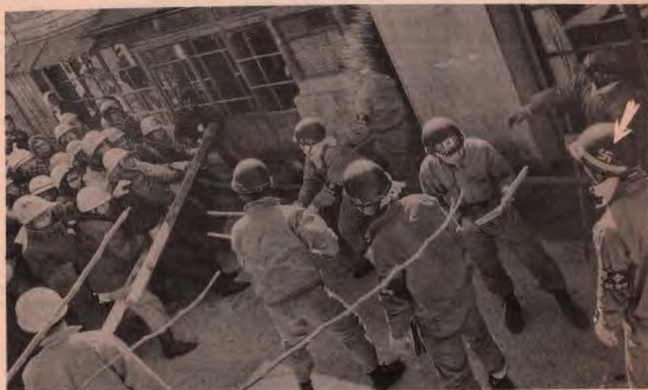
JAPANESE NAZIS BATTLE COMMUNISTS -Dressed in full battle regalia, Japanese Nazis ward off a contingent of Leftists during a battle in Tokyo streets.

JAPAN -The right-wing movement in Japan has been moving up swiftly over the past year. Thousands of swastika-adorned posters can be seen all over Japan and especially in Tokyo.