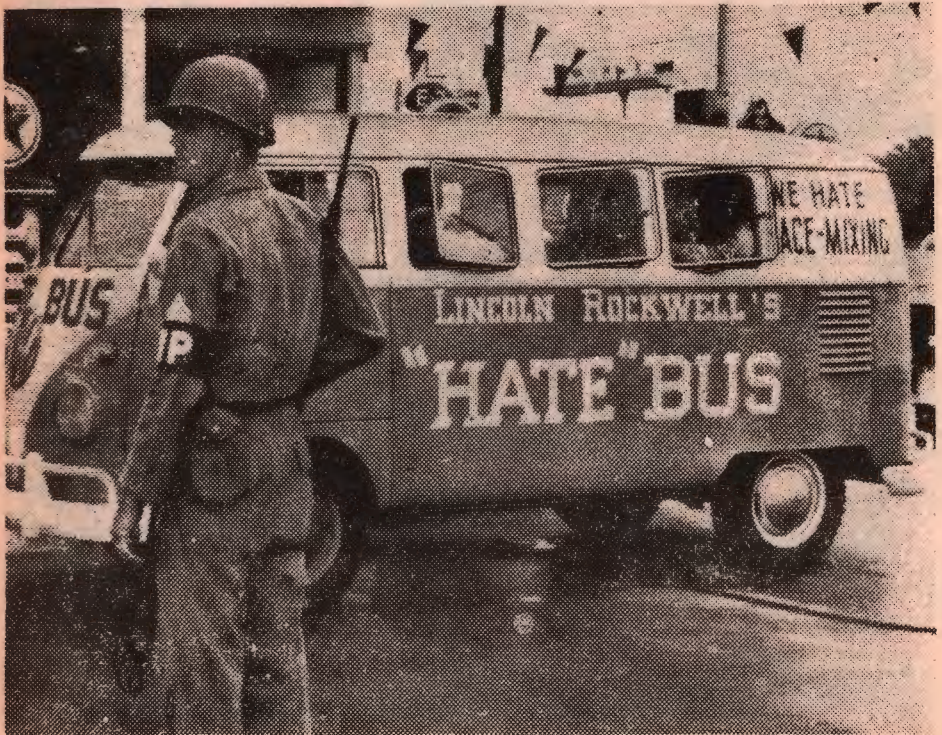
National Guardsman stands by American Nazi Party "Hate Bus"

From all appearances, it became obvious that the troops would be kept locked up indefinitely. In order to procure for themselves the right to a speedy trial, the Commander and Storm Troops began a self-imposed hunger strike. At first, Parish Prison Warden, Murtagh Rupp and his guards were apathetic . . . they did not believe that there were white men willing to starve for their race and nation . . . but as the days began to pass, and the Nazis continued to refuse food, the opposition soon realized that the troops were in dead earnest. As the hunger strike went into its