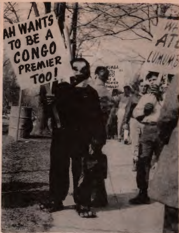
GIZENGA COMES TO WASHINGTON. American Nazi Party Storm Troopers stage protest picket line in front of the Belgian Embassy immediately after riot by black exchange students. ( Story on page 9)