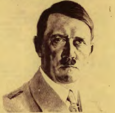
~ ADOLF HITLER ~