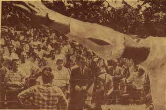
HE ATTRACTS REGULARLY AS MANY AS 1,000 CURIOSITY-SEEKING LISTENERS.

Commander Rockwell delivering a speech to a packed audience on the Mall between the nation's Capitol and the Washington Monument.