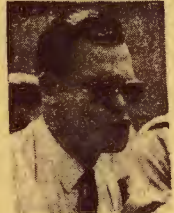
Man of Destiny