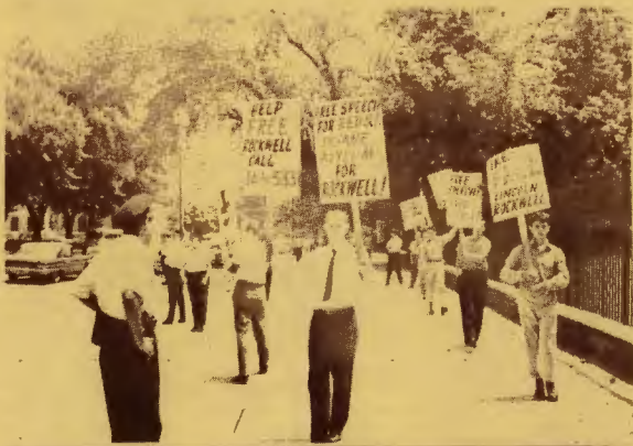
Protesting Cmdr. Rockwell's incarceration, troopers faithfully picket the White House as Negro policeman looks on.

The Commander ended a three day successful visit to Chicago last week. He had gone there to organize an Illinois branch of the Party. The move was met with a great deal of enthusiasm on the part of our troopers in that area, who are anxious to get started.