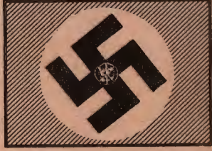
This is the Symbol of MY RACE

I believe we have the right to KEEP it a REPUBLIC, not a race-mixing Democracy as the Reds preach.