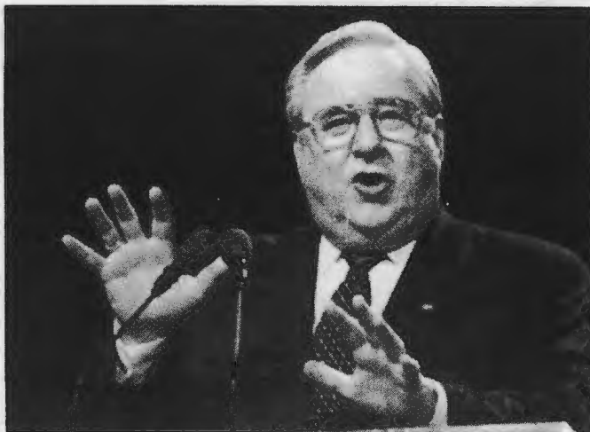
REV. JERRY FALWELL: Receiving Israel's blessing

"[The people of Germany] bear responsibility to confront the