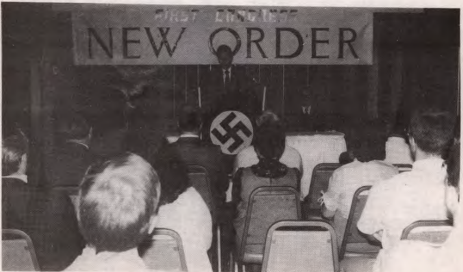
National Socialist delegates from across the country gather in Chicago for the First Congress of the New Order.

analysis of the condition of the West and the United States, which he explained was essential to a proper understanding of the significance of National Socialism and the role of the NEW ORDER. Proceeding to describe the decline of the West, he compared it with that of ancient Rome. No recovery was possible for Western civilization, he said, because its condition was terminal and represented the last gasp of an Old Order.