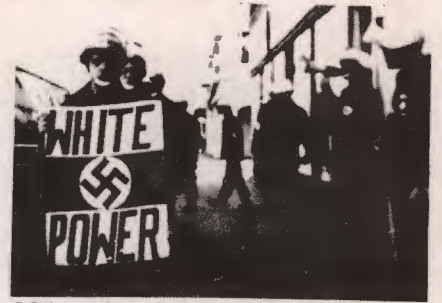
Milwaukee and Chicago troopers picketing bookstore of the revolutionary Communist Party.