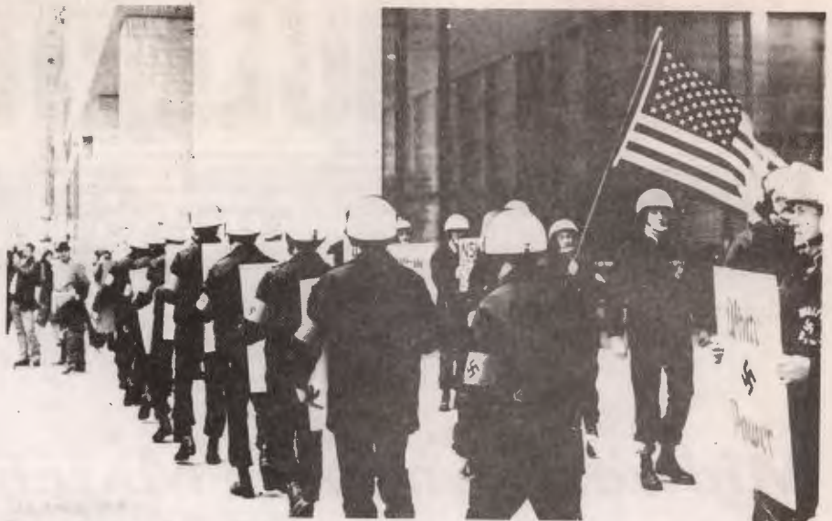
Stormtroops from Chicago, Milwaukee and Minneapolis picket a tiny "Smash the Nazis!" rally at Daly Plaza in Chicago, 15 April.