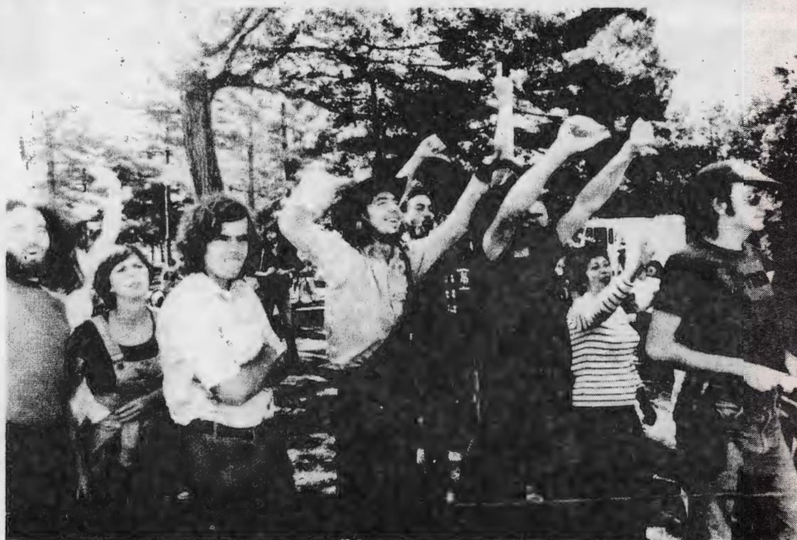
Demonstrators at Saturday's rally in Jackson Park.

If the rally is held there, Greenfield would have to have some of their men on the scene. The Nazis would neither confirm or deny whether the rally would be held at Whitnall.