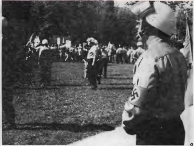
A view of the Jackson Park rally from within the ST perimeter