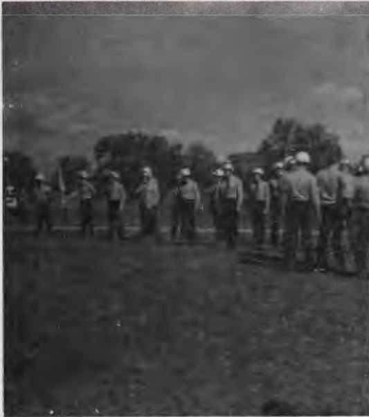
ST forming up before rally