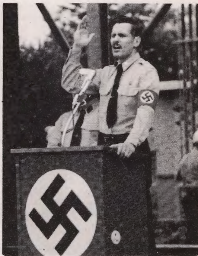
The Commander addressing Congress rally

The Congress itself is an internal affair, held in strict