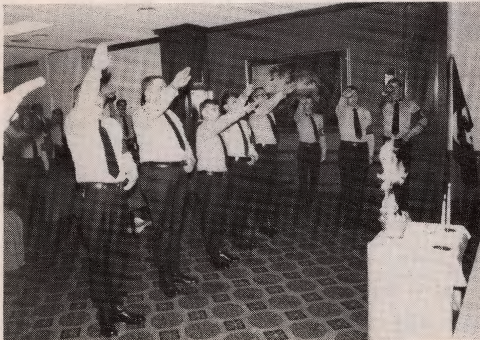
Commander swearing in new troops at ST ceremonies

NS Publications is offering 20 beautiful full-color photographs and slides of the Eighth Congress. Photographs are $12.00 per set; slides, $16.00. Order your set(s) today!