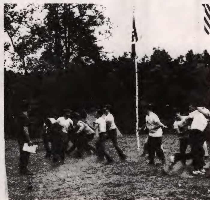
Practicing defensive combat formations