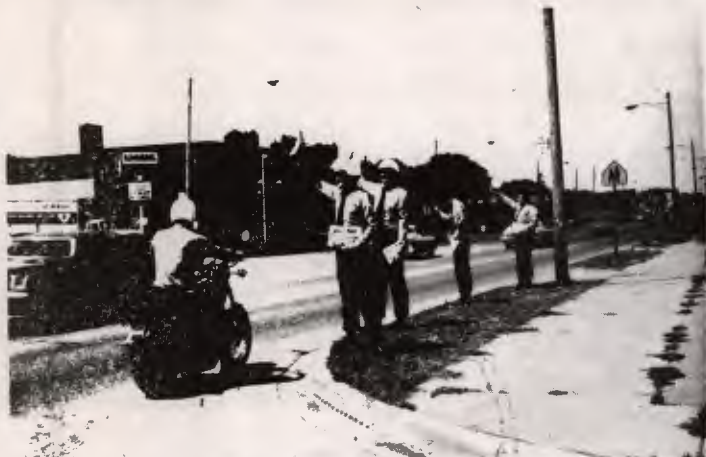
Uniformed activity in East Detroit