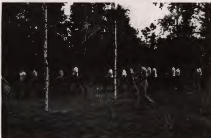
NCO's drilling troops