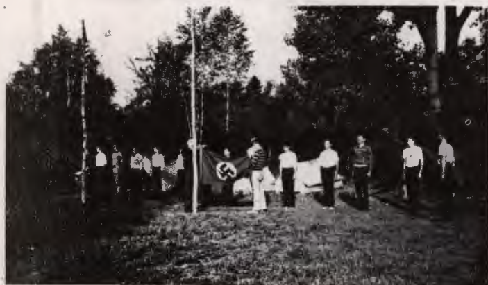
Flag raising ceremony at campsite