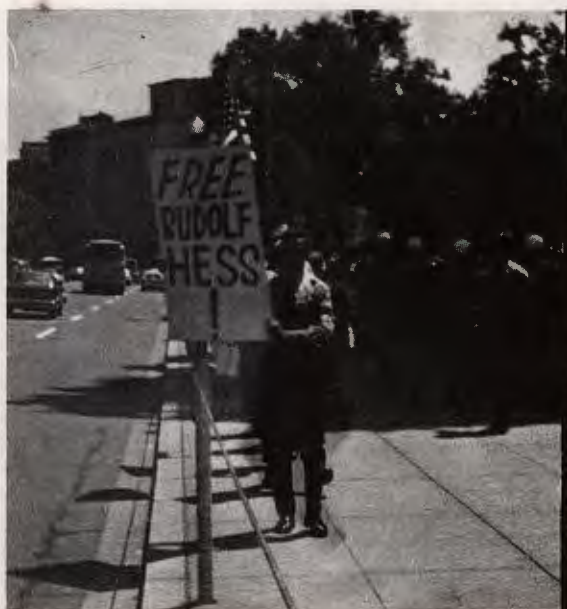
Cmdr. leading troops at White House demonstration

Later on, a special meeting was conducted at NHQ, at which the Commander spoke on the sacrifice being made by Rudolf Hess for the Cause.