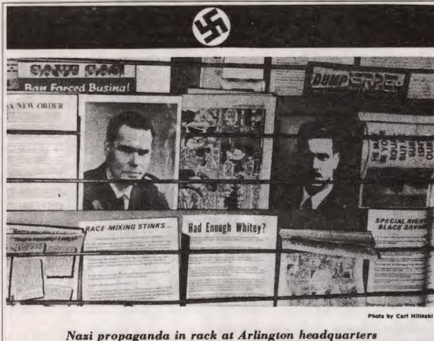
Nazi propaganda in rack at Arlington headquarters