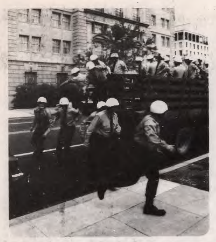
ST men storm out of transport trucks near the rally site.

The audience was reminded that the Founding Fathers were all White racists who did not consider the Negro to be a person, but that today the rights of Whites were secondary to those of Blacks. The prophecy of Benjamin Franklin and other warnings concerning the Jews were quoted, noting that history has proved that their fears were not unfounded. If their advice had been heeded, the crowd was told, America would not be in a situation today where the Jews control the biggest banks, the media and the government. The famous remarks of such contemporary Americans as Spiro Agnew and General Brown about the Jews were used to further illustrate that fact.