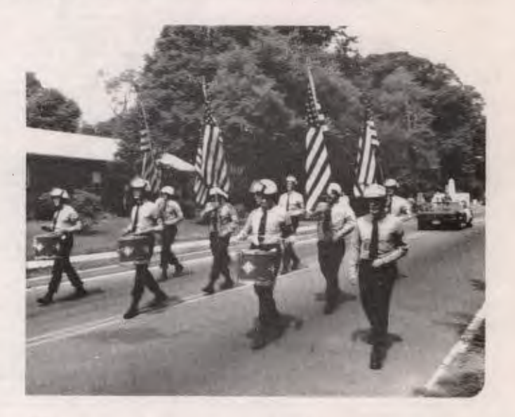
ST honor-guard contingent marching in Arlington parade.

From 10 a.m. to noon, an ST honor-guard contingent, including a three-man drum corps and five flag bearers, represented the Party in Arlington County's Bicentennial parade. Our involvement in that community event went off without a hitch. The sight of squared-away ST men marching to a military-drum cadence, carrying American flags waving proudly in the breeze, drew continuous responses from the audience. Understandably, liberals, reactionaries and non-Whites were upset by what they saw, and replied with obscenities in disrespect of the occasion and despite the presence of women and children in the crowd. On the other hand, most of the Aryan citizens expressed their pleasure at seeing a parade contingent representing White Power. Out of over 100 groups involved in the parade, the National Socialist White People's Party was the only patriotic, anti-Communist, pro-White organization.