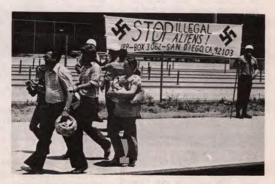
The 12-foot banner above was seen by thousands of White tourists