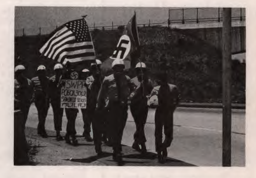
ST column marching to Mexican border, where activity was held