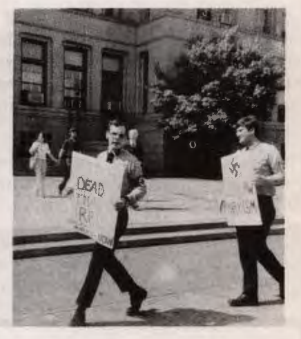
Anti-Marxist picket at city hall

ST.LOUIS POST-DISPATCH Fri., May 7, 1976