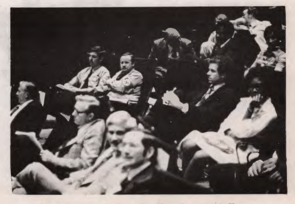
Stormtroopers attending school board meeting in Houston

"On the evening of 12 June, uniformed ST from the Hous-