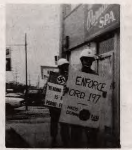
ST men picket porno store

Due to complaints from Black school officials to the city's police department,