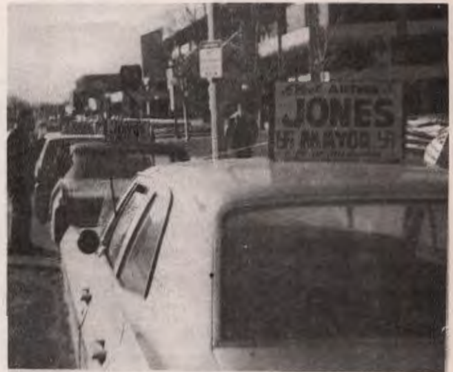
A view of the motor caravan used in the campaign

The Party has received almost daily newspaper coverage in the past two weeks. Due to space limitations, only a few examples are reproduced on the next page.