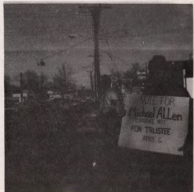
Activists conducting a "street-corner" campaign