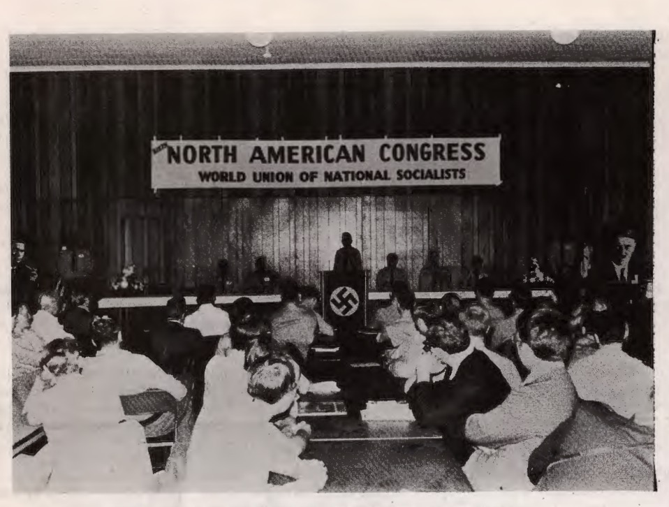
The Congress Hall during the Sunday evening session