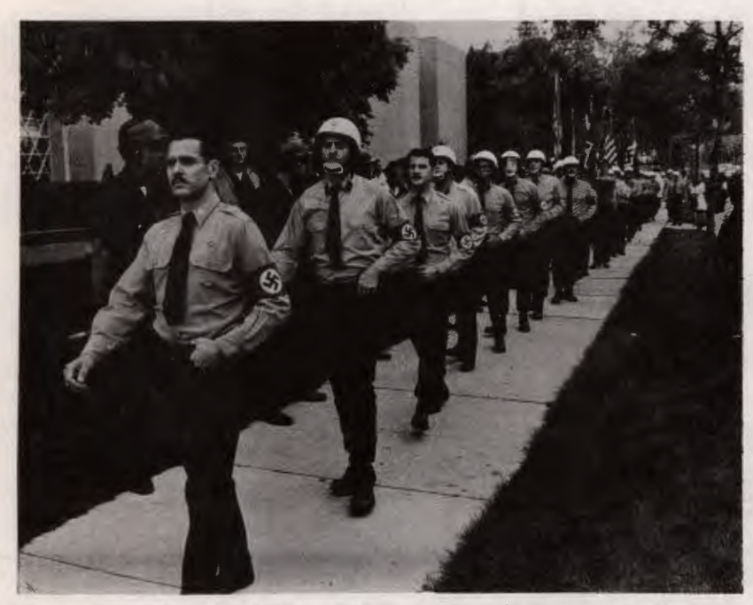
Troops in a picket against Zionism in front of Jewish Community Center

The sole incident occurred when a Jewess tried to block the road in front of the White Power bus with her car, and was hastily shoved out of the way by Stormtroop personnel. At the conclusion of the picket, the troops reassembled at Humboldt Park and were directed to the Congress hall, as were non-uniformed personnel.