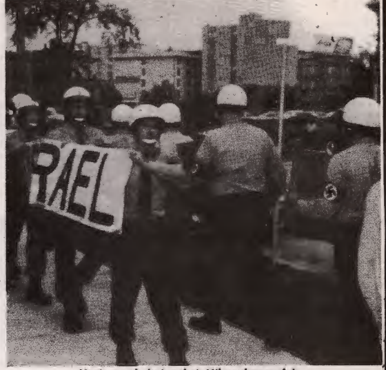
Nazis march during their Milwaukee confab.