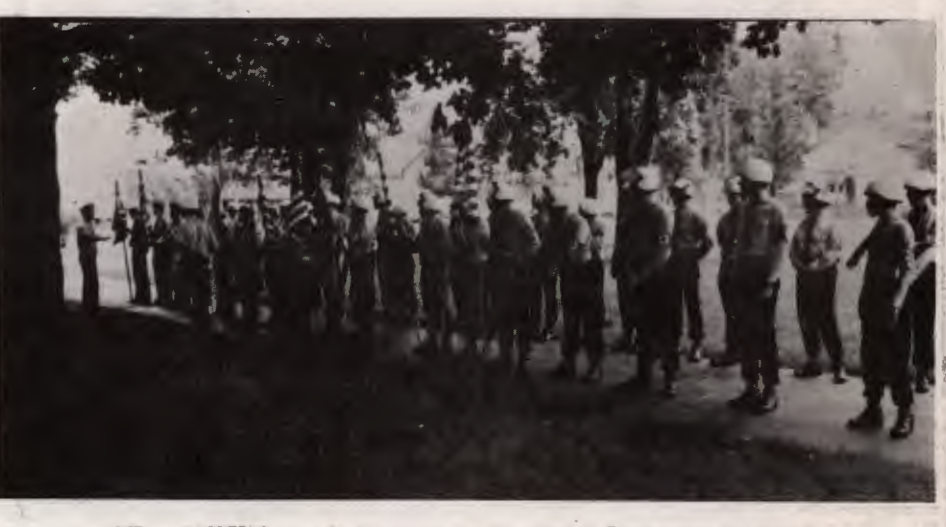
ST and NSYM members muster in Humboldt Park prior to march

From the War Memorial, the column marched to the Jewish Community Center, where they were met by a herd of Jews wearing yellow Star-of-David armbands. The Commander led the troops in a "Dump Israel" picket for over an hour in front of the Center. All the Jews could do to disrupt the National Socialists was to dance and sing Khazar songs. Other hebes performed for the TV cameras by screaming, weeping, tearing their hair, etc. as the ST bellowed out "What do we want? NO MORE JEW WARS!","DUMP ISRAEL" and "SMASH ZIONIST GANGSTERS!"