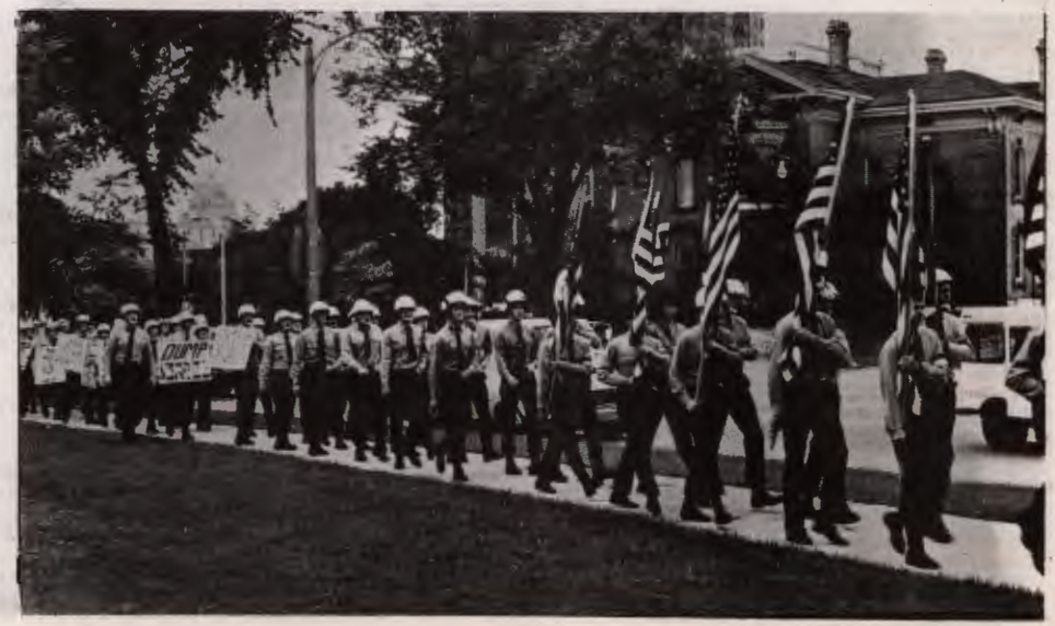
Uniformed contingent marching on the way to the War Memorial Center