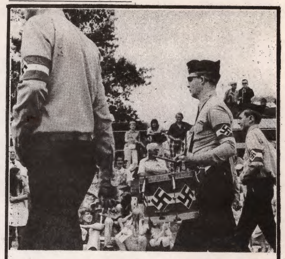
A unit of the National Socialist White People's Party marched in the Arlington parade.