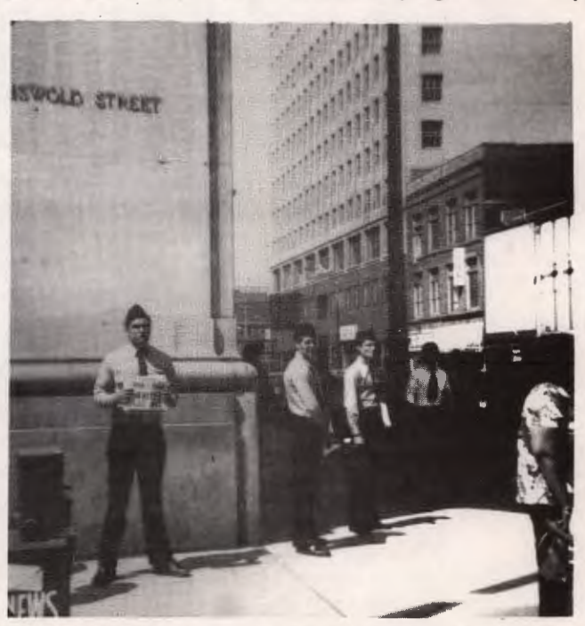
WHITE POWER sale at one of Detroit's busiest intersections