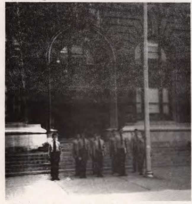
NSYM at staging area in front of Detroit police building

After about an hour there, one Youth member was taken into a nearby police "mini-station," to be issued a ticket on the pretext that a license was required to sell the newspaper in the city. After clarification of the law with the city legal bureaucracy,