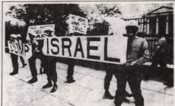
• Femton nazister i bruna skjorter, svarta hakkers och vita hjälmor demonstrerade utanför Vita huset. De vill att Nixon skall "spöla Israel".