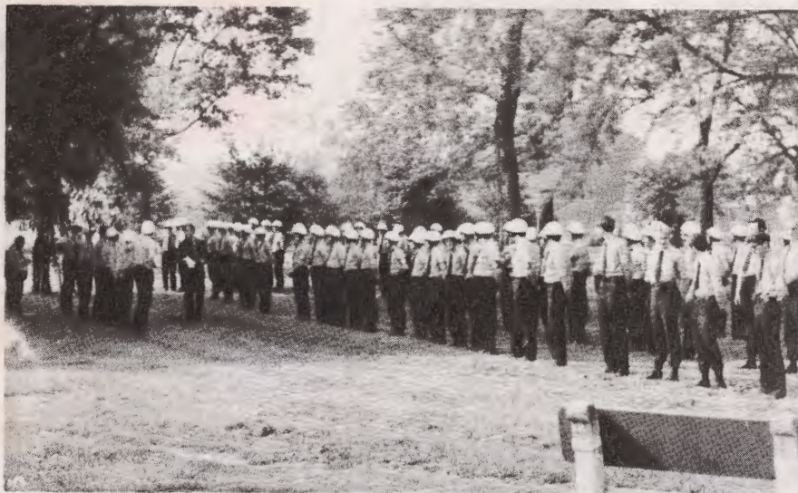
The troopers form up in a local park.

The troopers assembled ready to march at 12 sharp. Just as the march was ready to start it was met by a large contingent of police and newsmen. The Commander was informed that Mayor Perk had revoked our permit and we were not allowed to march. The Commander then stated to the police chief that Mayor Perk had no authority over National Socialists and that we definitely would march. After a 45-minute delay the marchers set off. More than a block long and lined up in columns of threes, the marchers made their way down the main avenue of Cleveland, which had been blocked off for the specific use of the Stormtroops. About half-way to their destination, the National Socialist began to chant in unison, "White Power" over and over. As the column marched into the very heart of downtown Cleveland, they discovered the streets were lined with thousands upon thousands of Blacks who almost turned white at the sight of brave White men. With flags held high, the procession left Euclid Avenue and entered the large downtown square where they deployed to defend the speakers platform at the impending rally.