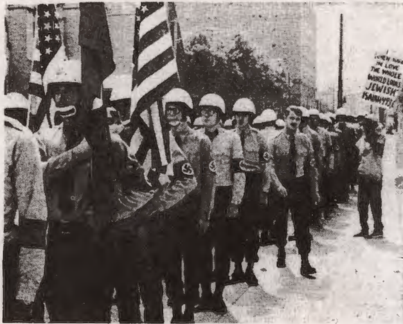
Nazis parading in Cleveland

Let us not forget that thousands of American boys were killed in a war