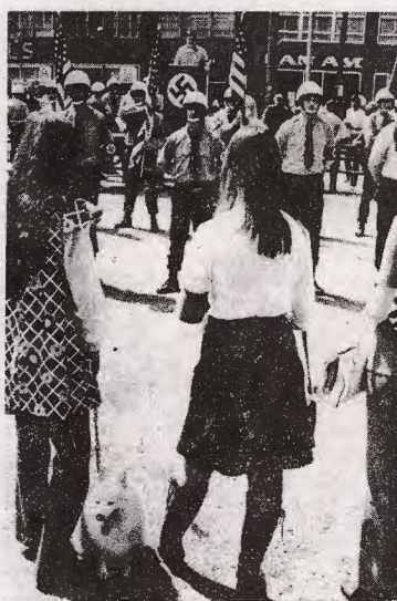
Storm troopers parade down Euclid Ave. (left), speak at Square later (right).