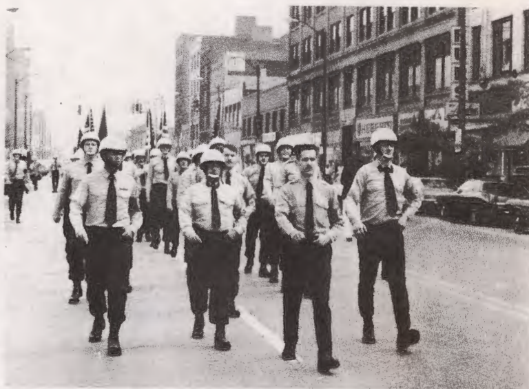
The march starts down Euclid Ave.

The troopers assembled ready to march at 12 sharp. Just as the march was ready to start it was met by a large contingent of police and newsmen. The Commander was informed that Mayor Perk had revoked our permit and we were not allowed to march. The Commander then stated to the police chief that Mayor Perk had no authority over National Socialists and that we definitely would march. After a 45-minute delay the marchers set off. More than a block long and lined up in columns of threes, the marchers made their way down the main avenue of Cleveland, which had been blocked off for the specific use of the Stormtroops. About half-way to their destination, the National Socialist began to chant in unison, "White Power" over and over. As the column marched into the very heart of downtown Cleveland, they discovered the streets were lined with thousands upon thousands of Blacks who almost turned white at the sight of brave White men. With flags held high, the procession left Euclid Avenue and entered the large downtown square where they deployed to defend the speakers platform at the impending rally.