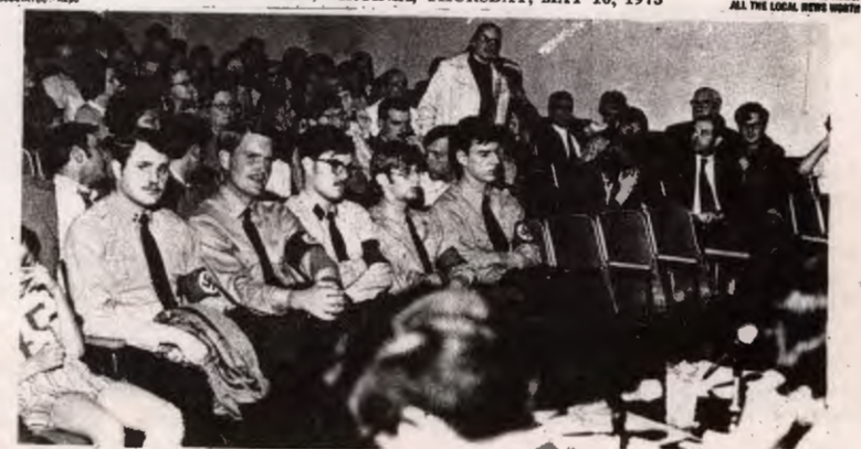
This photograph appeared on the front page of the Alexandria Gazette