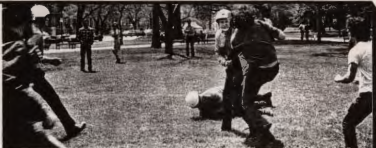
Members of local branches of the Jewish Defense League clash with a group from the National Socialist White People's Party (helmeted) at Lafayette Square Saturday afternoon.

"I feel that in this country it's wrong to