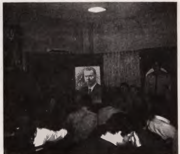
Chicago Unit celebrates Leader's birthday

The assembled returned the National Socialist greeting, giving the Aryan salute and shouting "Heil Hitler!" The Party Battle Song was then played.