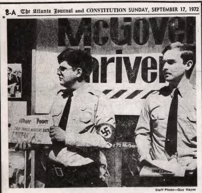
NAZIS PICKET HERE

NSWPP – Chicago Box 5865 Chicago, Illinois 60680