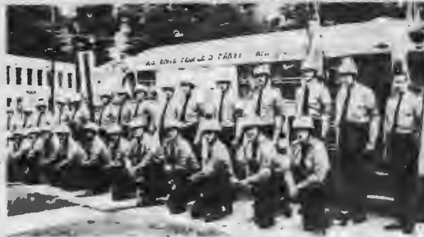
Battle-ready Stormtroopers before the "landing" at Miami Beach and the invasion of the Republican National Convention.

Commander's words, "To confront and expose the anti-White System and its lackeys," during the climactic face of the Republican Convention. A further purpose, he said, will be to help safeguard any White people endangered by threatened Communist riots at the Convention. Leaders of a number of pro-Aryan organizations were invited to join in the White Power demonstration, and several groups expressed interest. Operation Beachhead was scheduled for August 19-23. A full report will be published in next month's WHITE POWER.