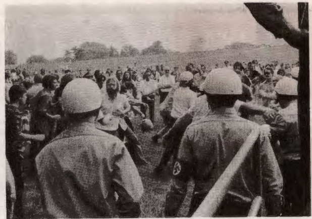
July 2 — At left, Stormtroopers smashing through Red hecklers. At right, police move in to push back Stormtroopers and pick up Commies, Jews, degenerates, and niggers.