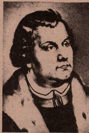
Martin Luther, one of the world's greatest men, to this very day he affects our daily lives.

Wartburg Castle where Luther translated Greek Bible into German. Note Red East Germany posted a picture of Karl Marx, who was descended from a long line of rabbis, in front of Luther's castle.