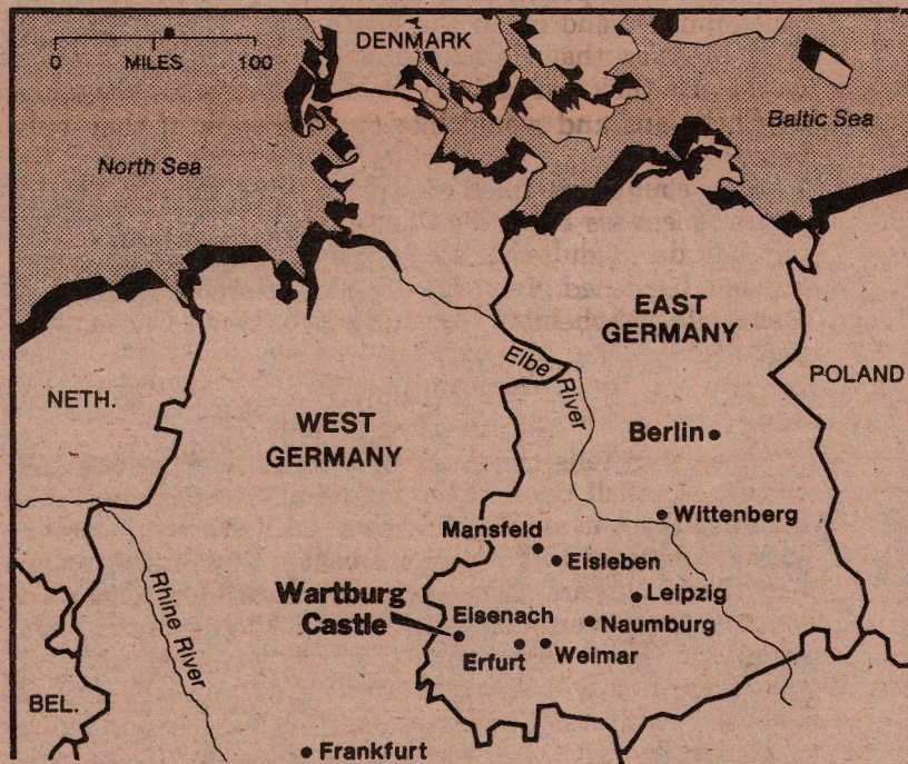
The Land of Luther.

Saxony — the small area in which Luther traveled — preached, wrote and changed the world for all time to come.