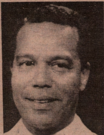
Minister Louis Farrakhan has courage to expose The Talmud.

The following are Farrakhan's statements followed by brief excerpts from the Jewish Talmud. Read both then decide for yourself, whether or not Farrakhan is justified in making these remarks.