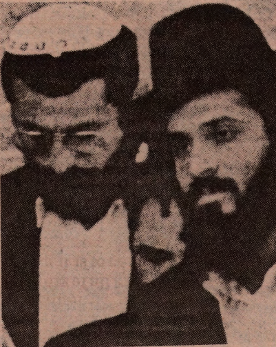
Jewish Orthodox Rabbis keep their "religion" secret.

Ferraro says the Jews should keep the Golan Heights! The Chicago Jewish Sentinel of July 26, quotes her, "in regards to the Golan Heights there is no way that, if I were prime minister of Israel, I would ever agree to its being given back to anyone."