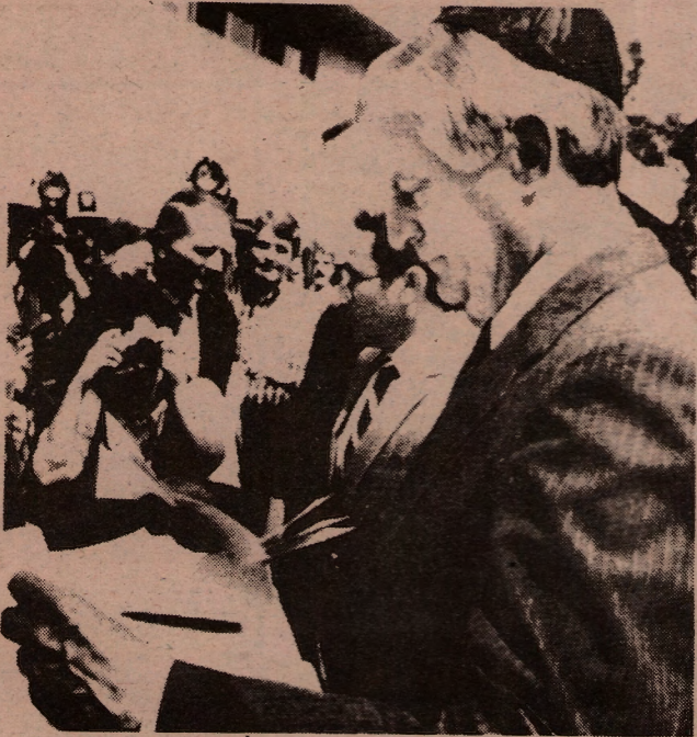
Mondale wearing Jew skull cap praying at Wiesenthal Holocaust tourist site in Los Angeles.