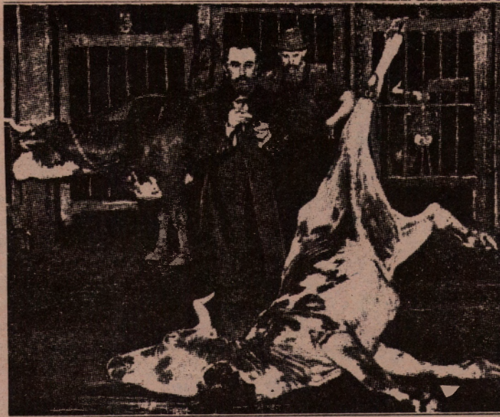
Shocking photo of religious Jew "Shohet," immediately after slashing throat of cattle, the hind leg is raised by a chain while in his death agony — without prior stunning — he slowly bleeds to death!

The chief rabbi, Sir Immanuel Jakobovits, condemned the attack on shechita as "deplorable," saying that "decades of research had constantly reaffirmed that no method of slaughter had been devised that was more humane than shechita ." He said it was "disgraceful that the religious rights of our community as enshrined in parliamentary legislation should again be challenged." However, he added that he was confident that the "renewed agitation" would be defeated, and prevent "untold hardship" inflicted on Jews and Moslems, as previous attacks on ritual slaughter had been defeated.