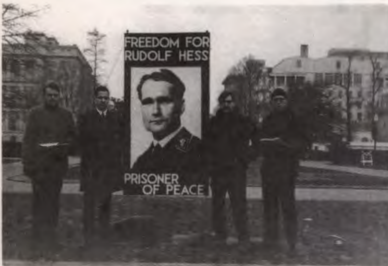
Commander heads group at Rudolf Hess vigil.

Although participants stood through sub-freezing weather, rain, and sleet to dramatize the plight of this living martyr, not one word was mentioned even in area newspapers! But on Christmas Eve, as the final hours allowed for the vigil passed, an integrated herd of Quakers stood a short evening peace vigil across from the National Socialists. Needless to say, this token pacifist gesture received national news coverage!