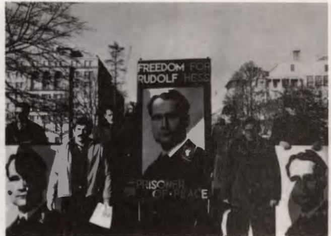
National Socialists demonstrate for Hess