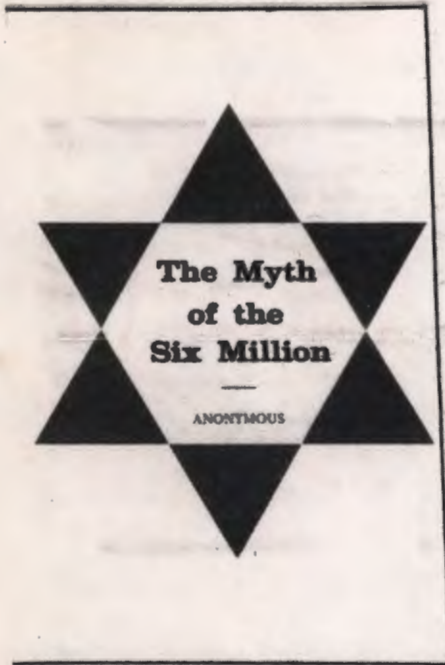
The Myth of the Six Million Cardcover $2

Three new books being offered through NS Publications: