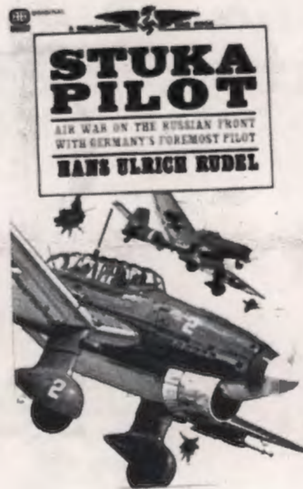
Stuka Pilot by Hans Rudel Paperback $.75