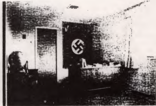
Office of the National Leader

Meanwhile, an increasing number of visitors from the Washington metropolitan area have visited Party Headquarters as a result of the stepped-up NS recruiting activity.