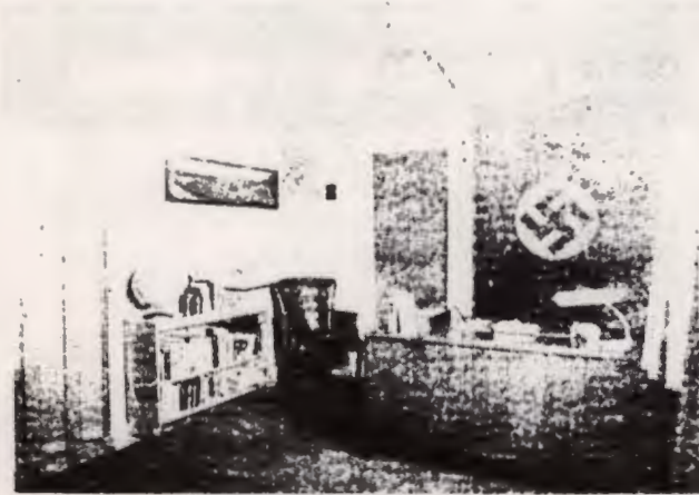
2507 N. Franklin Road Arlington, Va.

Since its opening on 30 May, the National Headquarters has welcomed a steady stream of members and supporters from all parts of the country. We hope that all members and supporters will be able to visit Arlington at the earliest possible opportunity, especially during the summer months.