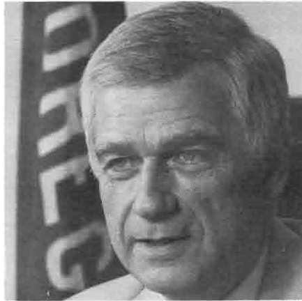
Hatfield -- is he or isn't he?