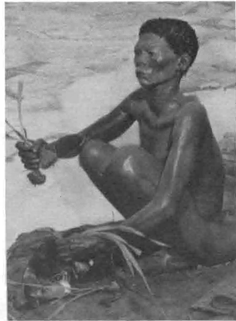
Bushwoman preparing dinner of roots

The Bushmen's skin is more yellow than anything else, quite unlike Negro skin. Their hair is not kinky like that of Negroes, and their noses not so flat and flaring. They look more Chinese than Negro and were altogether a mysterious people, much more peculiar than Australian Aborigines. Their language is a mere succession of clicks. They can count up to three, which is one more than a baboon can count. As it happens, the hair of the Bushman in the picture is not entirely typical in that it is generally more "peppercorn," that is, bare skull interspersed with tufts of hair.