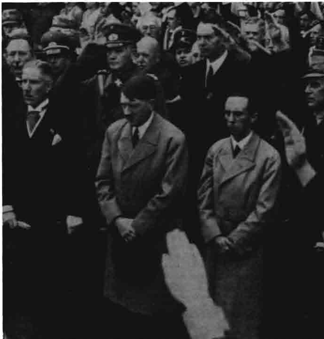
Josef Goebbels with Der Boss

it in the form of Panzer divisions. It was his boundless energy and indomitable will that kept Germany fighting long after any other country would have collapsed into chaos.