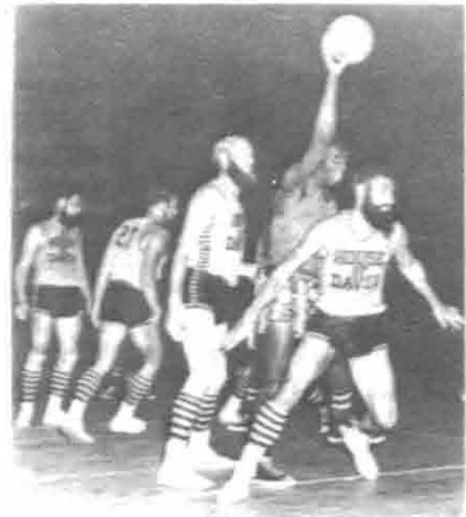
Tenants 110, Landlords 0.

spends six hours per day "thinking about guys," two hours "sipping diet drinks," and 1 1/2 hours "giving Iranian students the brush-off."