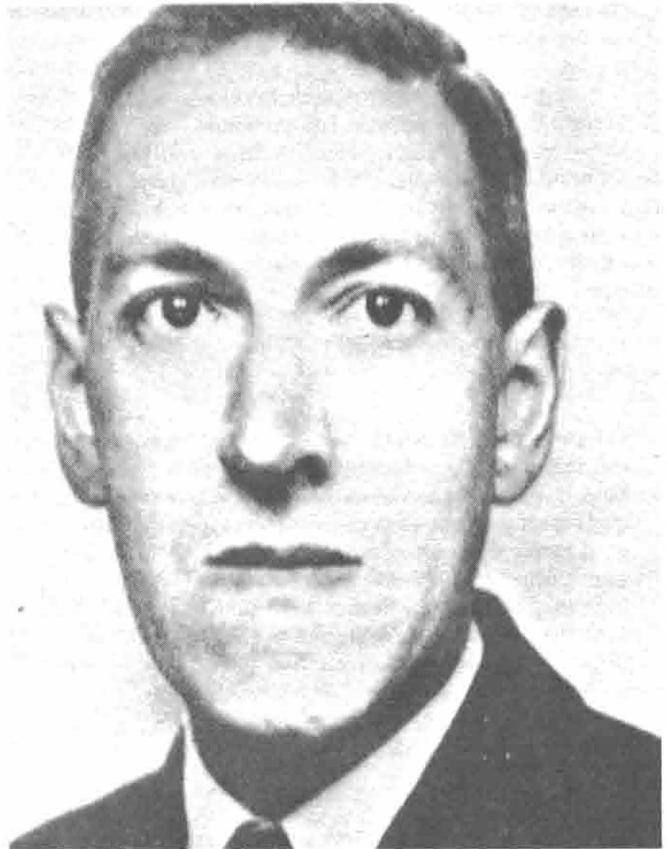
Howard Phillips Lovecraft

Like Poe, Lovecraft first won acclaim, at least in intellectual circles, in France. Like his fellow New Englander, Emily Dickinson, he was discovered by his own countrymen (except for a few literary cultists) when he was no longer among the living. Now that his popularity has