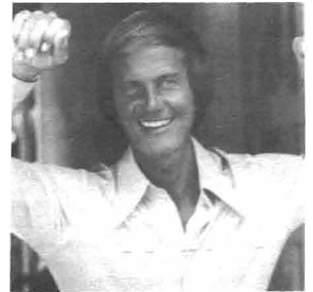
Pat Boone -- booster of Zion

PAT BOONE was a star attraction at a recent Beverly Hills fundraiser for Ben Gurion University. He was well qualified. A gold chain around his neck flaunted the Star of David, and it was Pat Boone who wrote the lyrics, "This land is mine . . ."