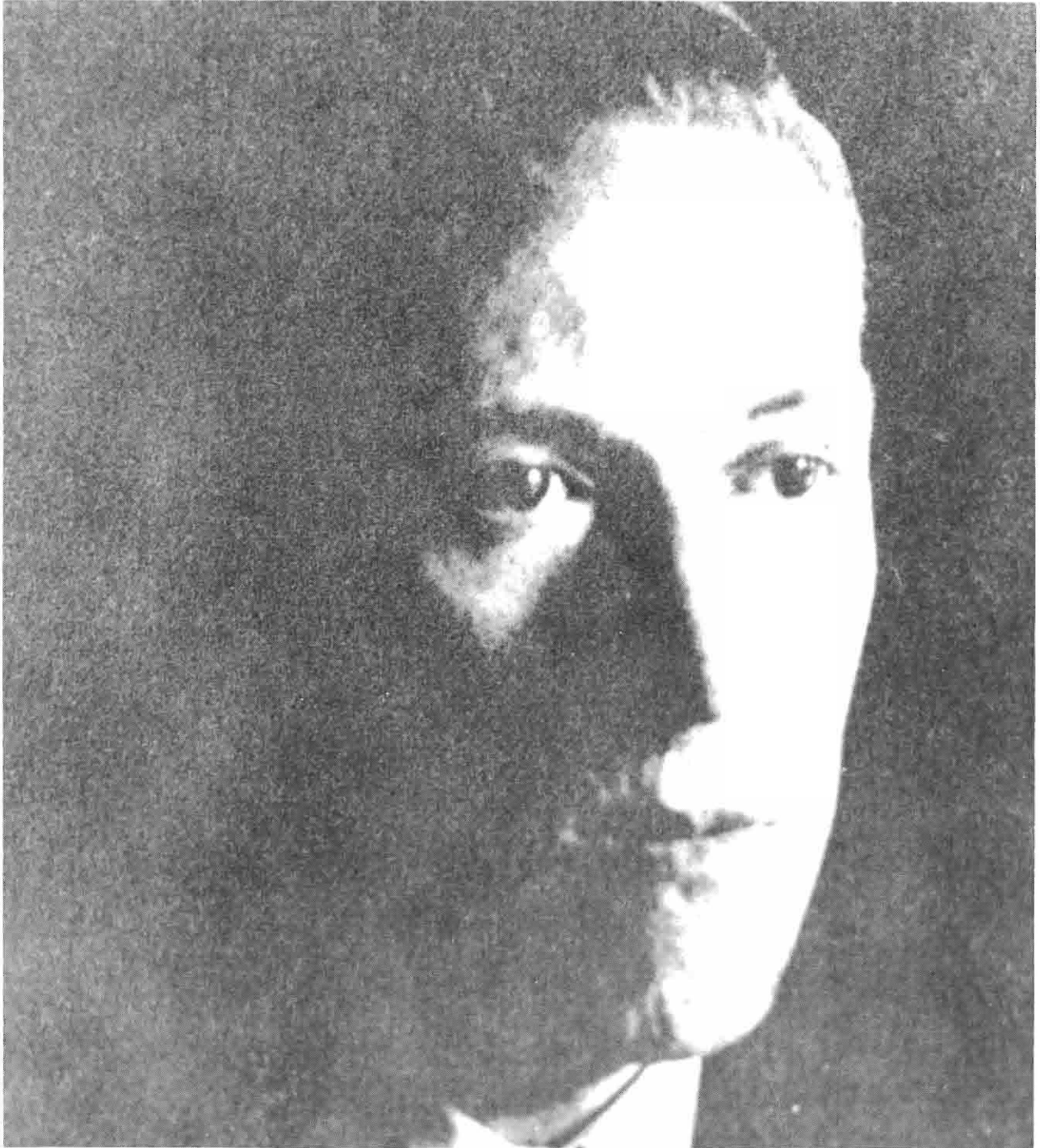
H.P. LOVECRAFT -- AN AMERICAN ORIGINAL