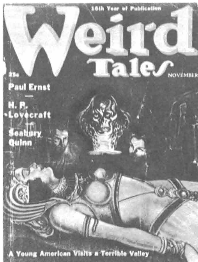
For years one of Lovecraft's few literary outlets