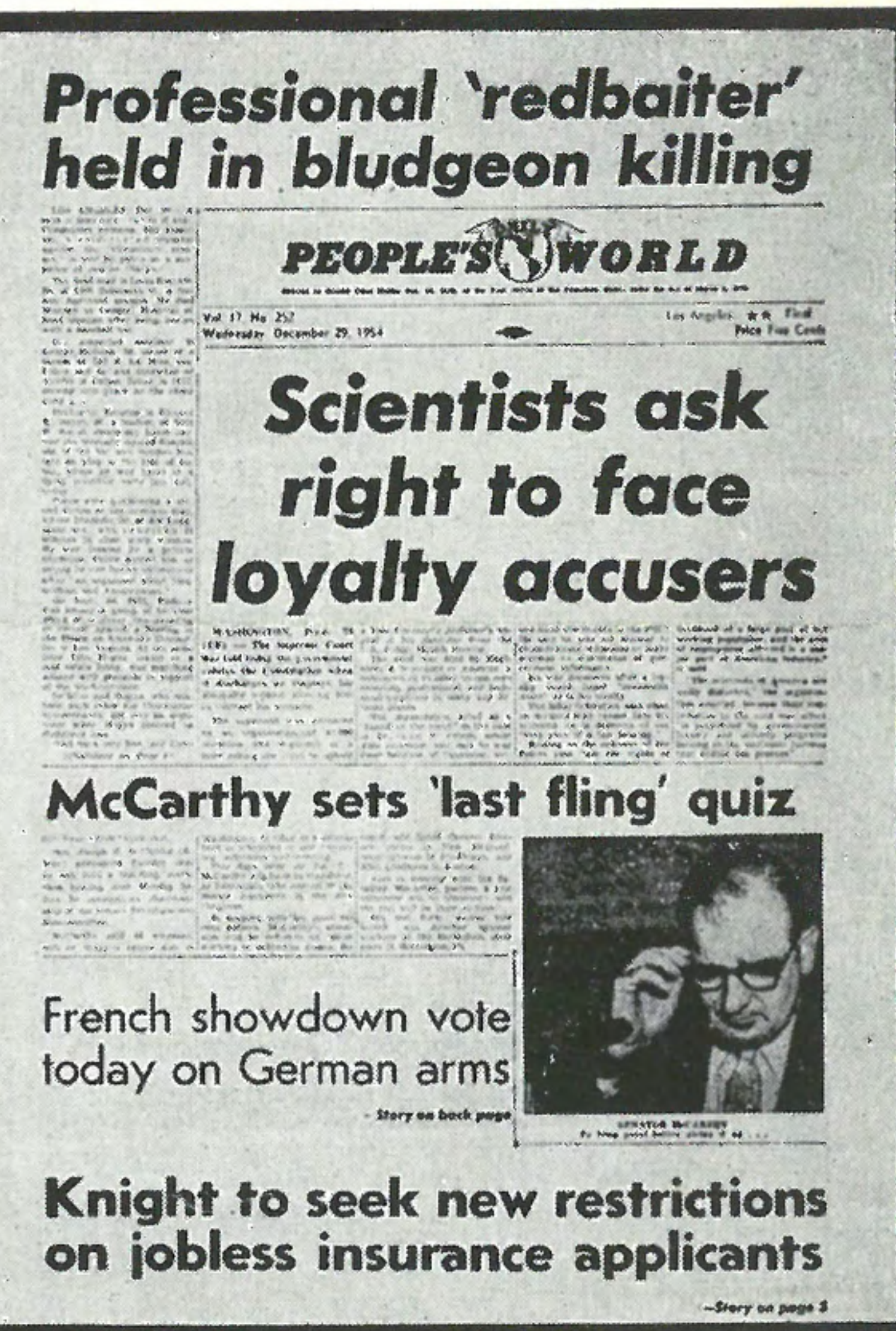
DAILY PEOPLE'S WORLD, the Party's official West Coast newspaper. As indicated below, all three of these key publications are Jewish controlled. So, for that matter, is the remainder of the Communist press. . .

THE DAILY PEOPLE'S WORLD is the country's third Communist daily newspaper. It is described by the Un-American Activities Committee's "Guide to Subversive