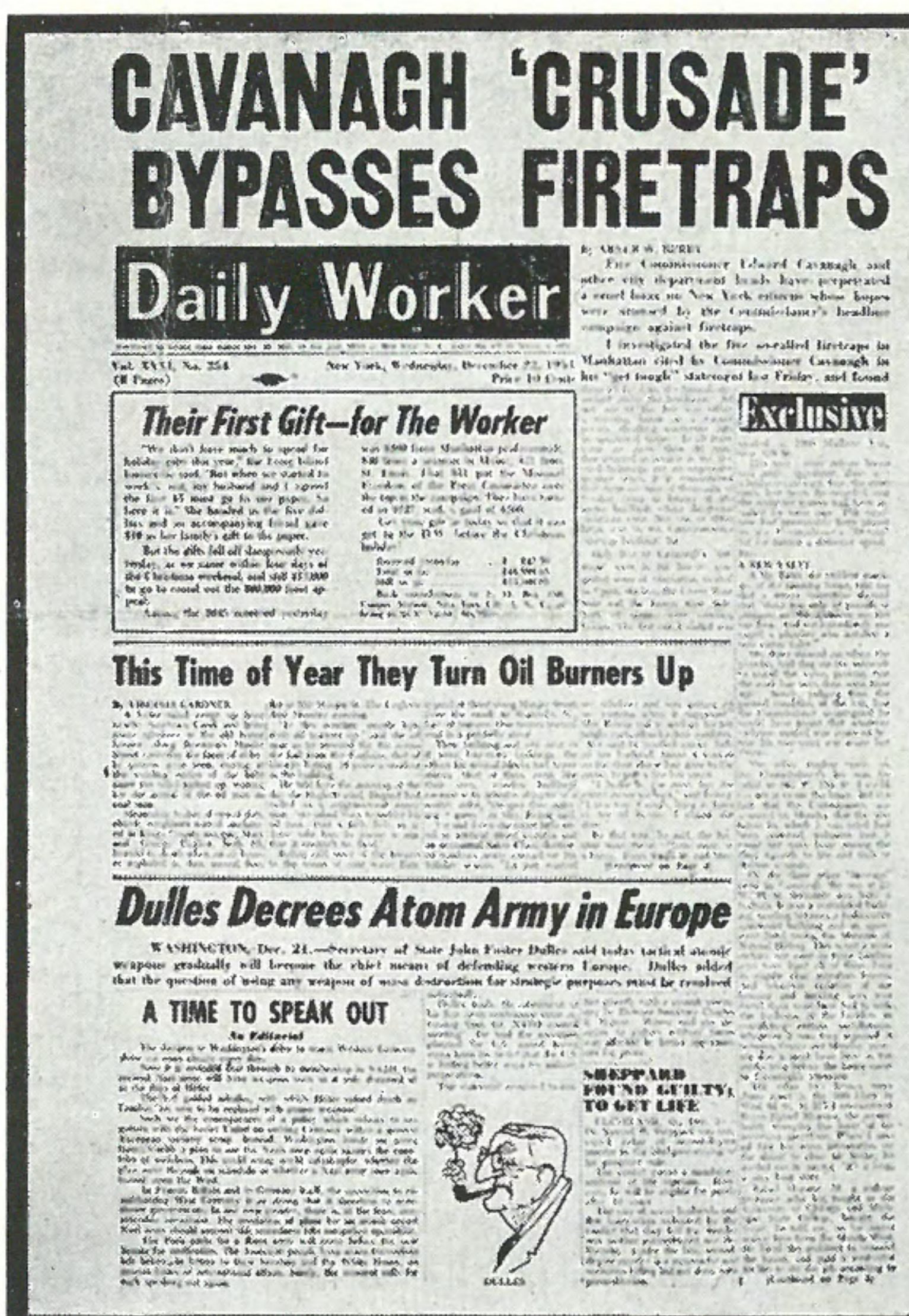
In the United States the Communist Party controls outright some 122 magazines, papers and periodicals of every description and category. But of these only three are daily newspapers. These three major propaganda outlets of

Perhaps the best index of the Jewishness of the U.S. Commu-