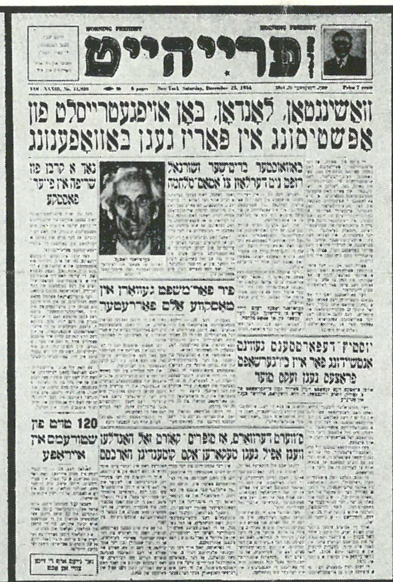
the Communist Party are shown above. To the left is the DAILY WORKER, best known of the Communist dailies. In the center is the MORNING FREIHEIT, printed in Yiddish and the largest Communist newspaper in America. To the extreme right is the