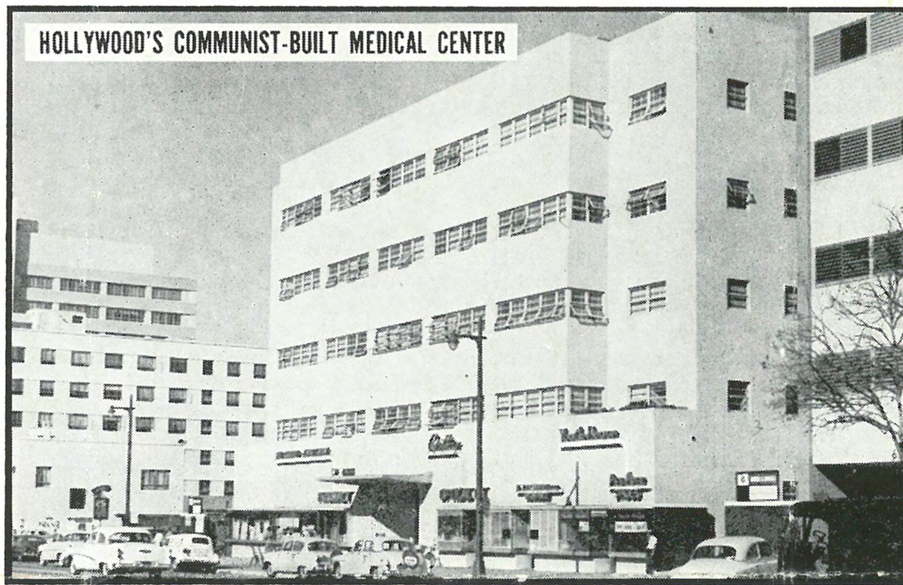
HOLLYWOOD'S COMMUNIST-BUILT MEDICAL CENTER

NEW YORK —At a conference attended by 1200 Jewish leaders in New York last month the United Jewish Appeal approved a U.S. fund-raising goal of $99,521,275.00 for 1955. This is $94 million less than the amount raised last year, and is approximately $20 million short of planned expenditures for 1955. The $20 million shortage will be made up by the West German government, which two years ago was blackmailed into an agreement to pay international Jewry a total of $822 millions in "reparations" over a ten year period. The major part of United Jewish Appeal's $120 million budget this year will go to Israel.