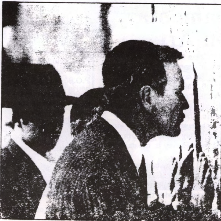
Bush in yarmulka kissing the Wailing Wall. He was dragged into the quicksand.

The Jews were delighted and the New York Times and A.M. Rosenthal crowed their victory. Now the U.S. must administer a 50x100 mile area of Iraq for the benefit of the Kurds, and the area continues to grow. And soon the U.S. will find