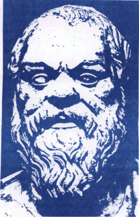
Socrates, a founder of philosophy

through scientific investigation and reason, and the other seeks it through mysticism. One searches for truth and the other presumes it.