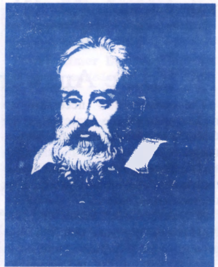
Galileo was threatened with burning by the Church, and his colleague Giordano Bruno was burned to death for advocating science over dogma.

The early Christians were right - philosophy and science were indeed a very great threat to their dogmas. The White was not only awe-struck by mystery, he was determined to unravel it - to demystify. And demystification is the arch enemy of Semitic religion. But the institutional, social and political power of the Church proved formidable. The struggle went back and forth, with the Christians still burning "witches" as late as the 18th Century.