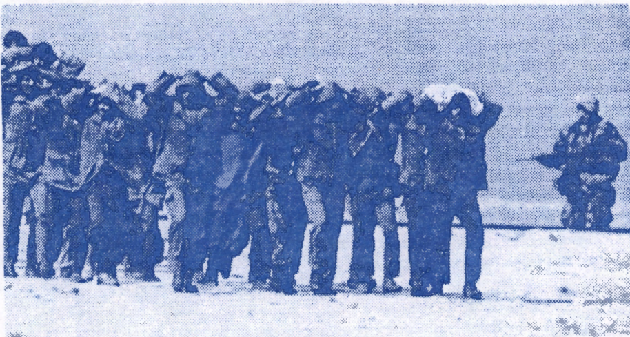
Why so few prisoners from such a great and rapid victory? Most likely because the Iraqi Army was already in full retreat before the Allies attacked on Feb. 24th.

In the Mar91 Nationalist we said, "Either the Iraqis never considered actually having to fight, planning on withdrawing before the fateful day arrived, or they are most incredibly stupid." In fact, they were both planning to withdraw and incredibly stupid. Any competent military commander would have prepared for the worst even if he thought it would probably not come about.