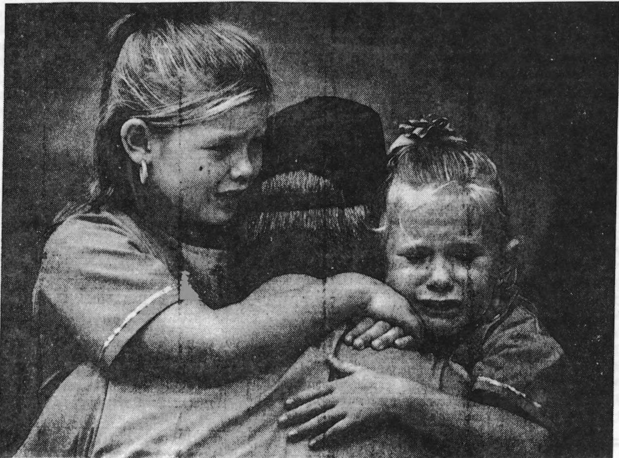
A naval officer hugs his kids upon departure for Arabia. This time let's ask why we are fighting before the war starts.

One such expert recently explained on the MacNeil Lehrer News Hour that in 1973 there were only 55 nations producing oil and