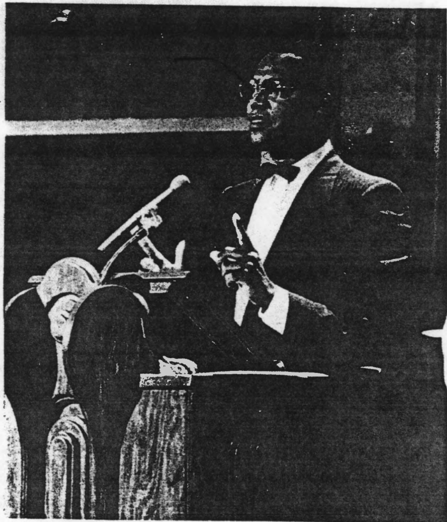
Louis Farrakhan, leader of the Nation of Islam, preaching Black Nationalism.

The Whites in the audience were stunned and charged Farrakhan with prejudice, claiming that they were lovers of all mankind and that he should be the same. Farrakhan patiently explained that it was he who was reasoning from the facts and drawing conclusions from his-