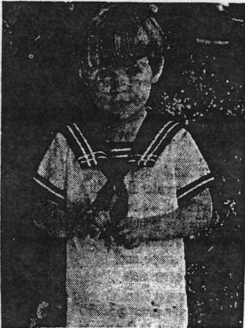
His future depends upon what you do now!

Just as stupid as the liberal/left is the conservative/right. These moral guardians of America will tell everyone how good multiracialism is, then will run out of the cities at night to avoid the racial cesspool they have created! These right-wingers will talk of the need to stop colored immigration and ignore the massive population growth of those non-whites already here! They pretend not to notice the fact that White people will soon become a racial minority here in America!