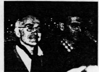
Robert Faurisson (1)

Though ignored by the court historians who get their books published by the System's big publishing houses, Rassinier's work made a mighty impact on Professor Faurisson, who picked up where Rassinier left off upon his death. Most people do not understand how much the revisionist historians have forced the exterminationist historians to give up. This is because the Jewish-controlled media (such as ABC, NBC, CBS, Time, Newsweek, U.S. News and World Report, The Washington Post, The New York Times, etc., etc.) refuses to inform the public on what Jewish historians have already conceded, and continues to pretend that the story of the Holocaust has been unchanged since the end of World War II. In fact, Jewish historians, including Raoul Hilberg (considered the best exterminationist Holocaust historian by the Jews and the System) have admitted in their books