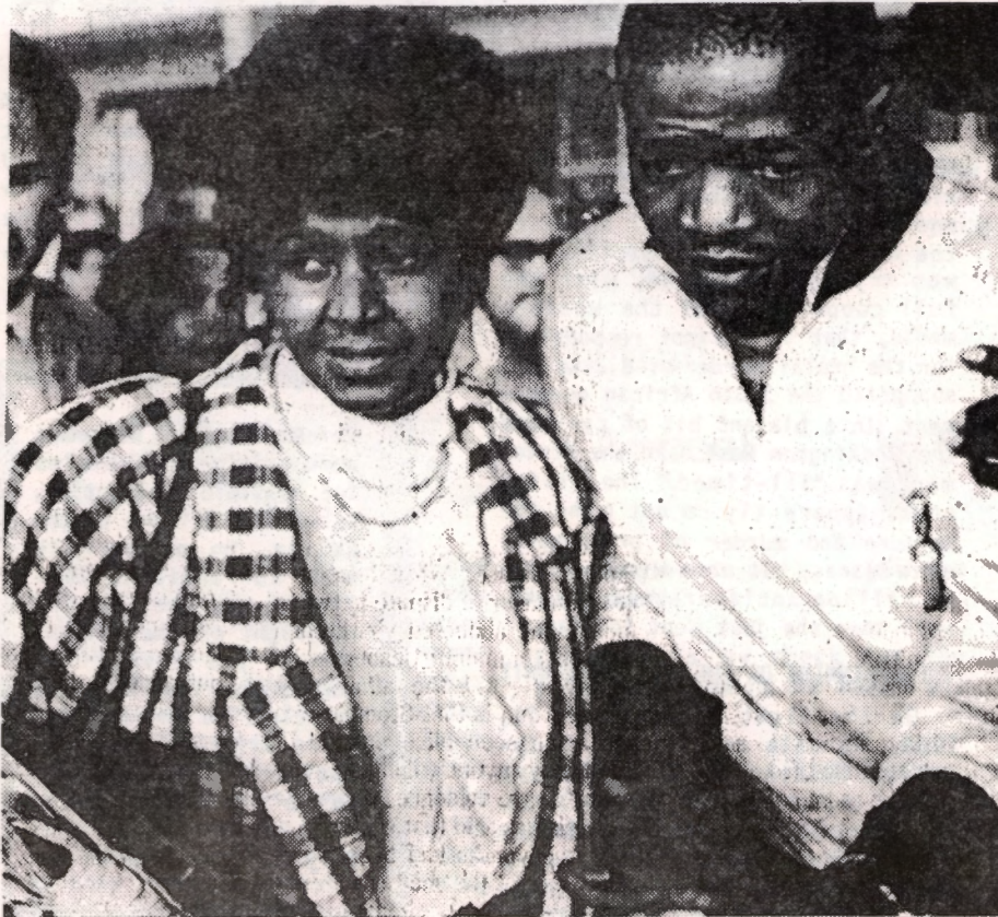
Winnie Mandela, the "mother of the revolution", with bodyguard.