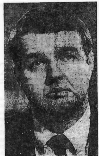
Former Transportation Secretary James Burnley IV.

Now we have President George Bush pledging to a new ethics in government. But so far it looks like just more of the same institutionalized legal corruption, and Bush is naive if he thinks he can really change that. His selection to head the Health and Human Services Department, a Black man named Louis Sullivan, wanted to keep getting paid by Morehouse College while he was a Cabinet Secretary. His selection for Defense, former Senator John Tower, has a well-earned reputation for drunkenness and womanizing on Capitol Hill, and worse, he is in the pocket of the