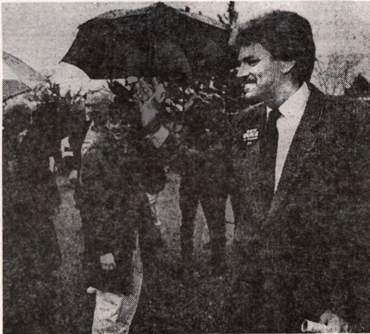
David Duke leaving voting booth.

nary voting in January, the System and its media sought to ignore Duke, just as they did in his 1988 Presidential bid, hoping that the result would be the same and Duke would once again disappear. But out