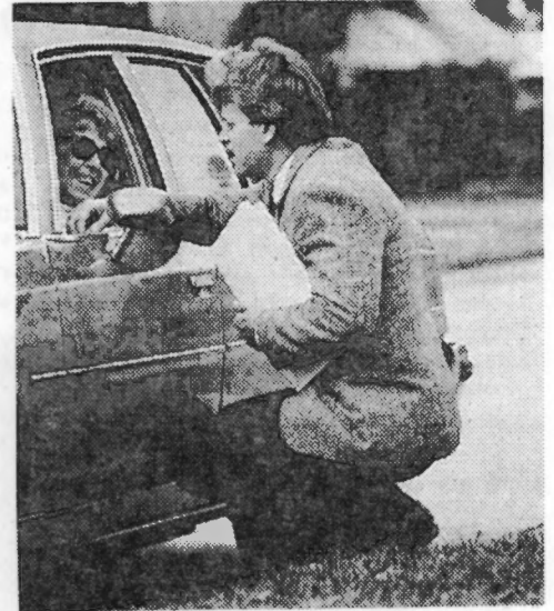
David Duke on campaign in Louisiana

Despite Duke's ideological and personal failings, his victory represents a major step forward for racialism if only because it proved such an embarrassment to the Plutocracy. It will encourage other racialists to run for office, and it will embolden the electorate to snub their noses at the System. The great taboo and atmosphere of fear