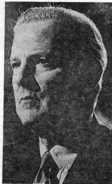
Secretary of State James Baker III