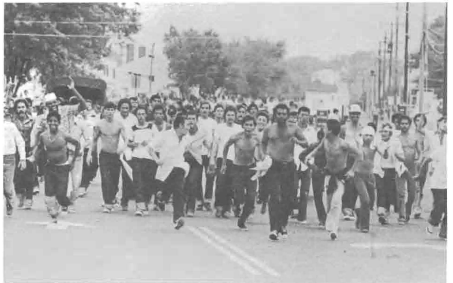
Cuban "refugees" running amuck in Fort Chaffee, Arkansas.