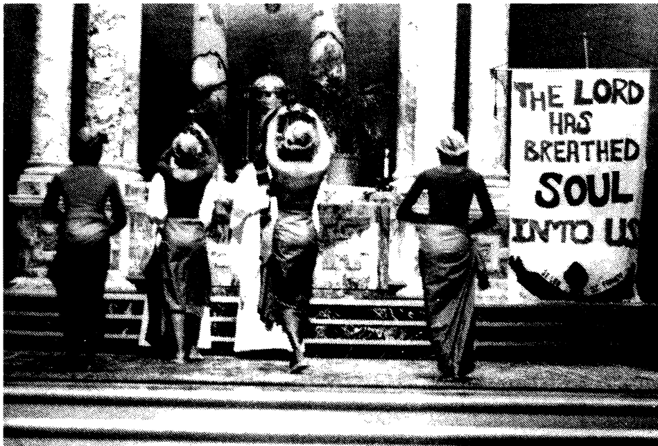
Praise the Lord

when a preacher-cum-aeronaut and his fifty followers failed to float heavenward like balloons, as he had so flatly predicted. Since some of those bound for glory had sold homes, businesses and cars in preparation for their flight departure, a little fast-talking was definitely in order on someone's part. Not missing a beat, the hot-air Christer said he "may" have had the date wrong, "but we know it's going to happen shortly."