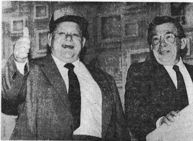
Jackie Presser and Lane Kirkland yuk it up at workers expense.

Unfortunately, workers who are not unionized are even more vulnerable to the predatory practices of the capitalists than those who are in the corrupt unions. The situation will only be resolved for the benefit of the nation and the workers when the National Democratic Front takes power and sets up Cooperatives in which the workers own their industries. Only then will the professional managers learn to treat their employees with respect and courtesy. GG