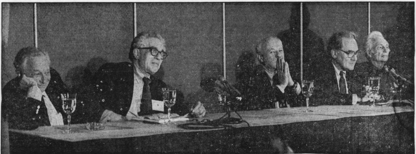
"Flexible" Jews dominated Second Thoughts Convention: From left, Irving Kristol, Nathan Glazer, Norman Podhoretz, Hilton Kramer, and William Phillips.

To understand this political phenomena, we must recognize that Jews have no loyalty to ideas above their primary concern which is the fate of Jewry. Indeed, the shift from left to right required no change in position on this most important issue. The Jews have such a lock on both the Republicans and the Democrats that both parties always support Israel and contend with one another to see which can promise the Jews the more. This is due not just to Jewish control of